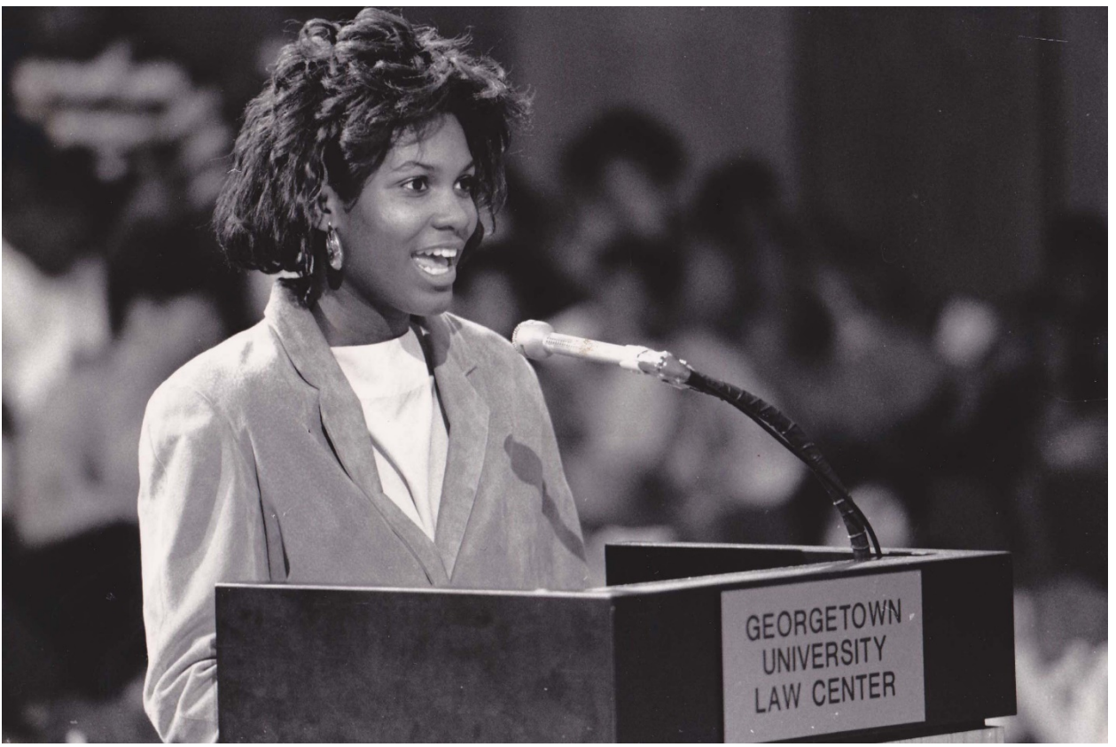
This was the first interscholastic high school mock trial competition. In short order, the mock trial competition expanded to all the D.C. public high schools. Eventually the concept spread across the country. Today the majority of states in the U.S. have high school mock trial competitions.

As evidence of success, the initial mock trial competition spread quickly to all of the Washington, D.C. public high schools and then to other states. There is now a robust national high school mock trial competition in the U.S. Winners of state competitions compete against each other at a national event that is held in a different city each year. All states and most U.S. territories send teams, and, in recent years, South Korea has also participated.<sup>10</sup>