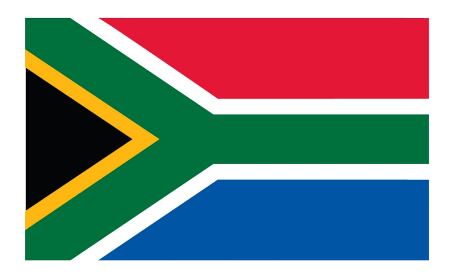
The success of the South Africa Street Law program marked the beginning of Street Law's international expansion, demonstrating that Street Law's practical law approach could work outside the U.S.—even in the most challenging of circumstances.