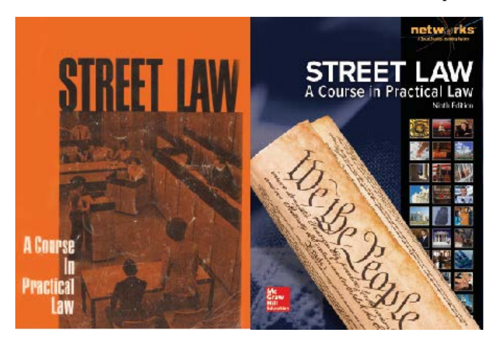
Together, Street Law and West Publishing pioneered the idea of a high school practical law textbook. Street Law's current publisher is McGraw-Hill Education and the 9th edition of the text was released in summer 2015. The various editions of Street Law have sold nearly one million copies in the United States.

As this national process began, Street Law staff members were encouraged to develop their lessons into a textbook. In 1974, in tandem with West Publishing Company, Street Law published a small run of textbooks for use in the Washington, D.C. program; the first national edition of Street Law: A Course in Practical Law was published in 1975.<sup>14</sup>