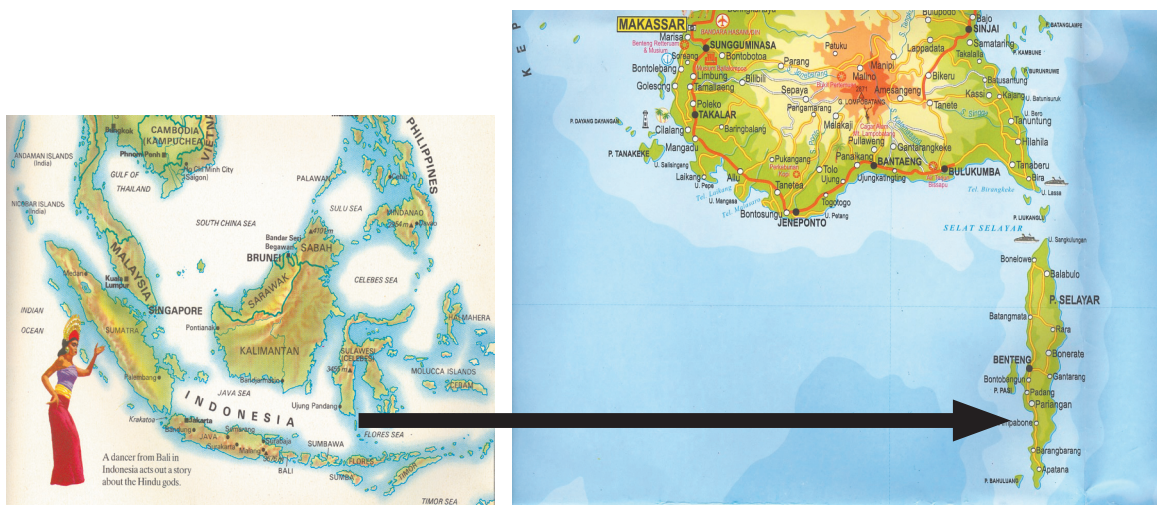
Figure 1. Geographical area of Selayar Island, South Sulawesi.