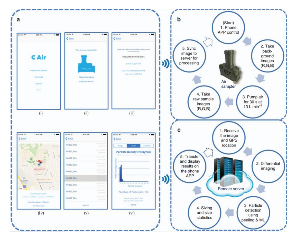
Fig. 2. Information system for air quality management in Los Angeles