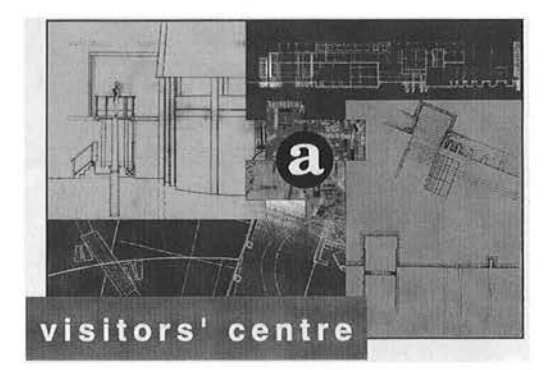
Conceived by the studio, an architectural advertisement for public display and reaction.

Over a five week term, students were asked to design an alternative to Auckland's Visitor Information Centre on its current downtown site adjacent to Auckland Town Hall on Aotea Square.