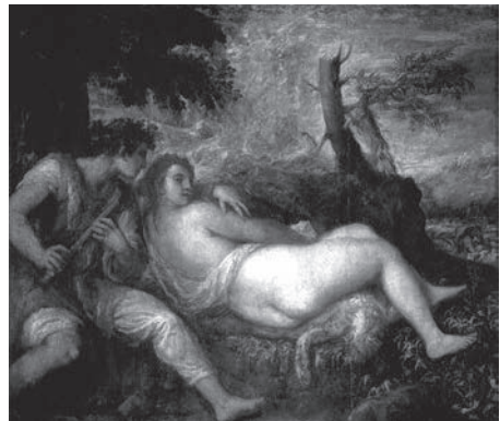
Figure 4: Titian, Nymph and Shepherd (Vienna, Kunsthistorisches m, 1570-75)

Agamben's second example is a late work by Titian known as Nymph and Shepherd (Vienna, Kunsthistorisches Museum, 1570-75) [Figure 4]. There are two figures in the foreground in a dark country landscape. The shep-