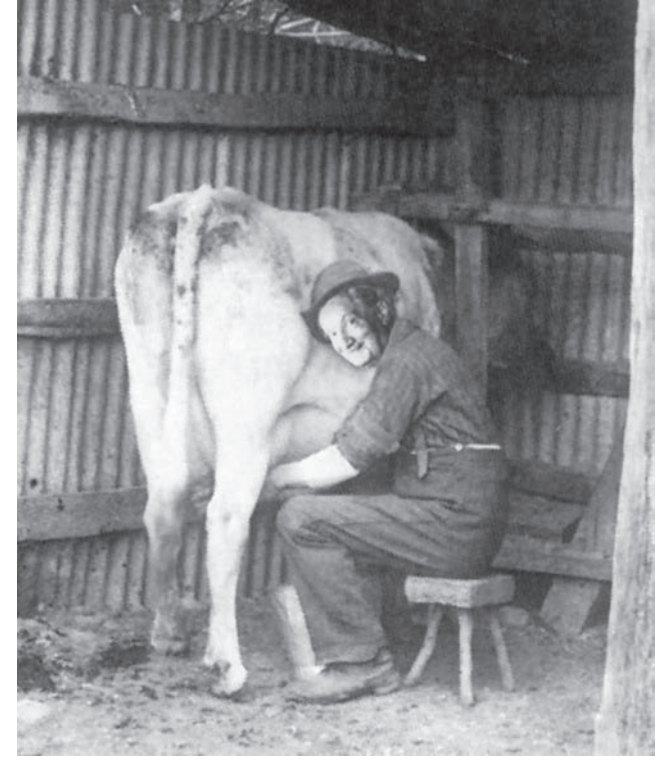
Figure 3: Heidegger hand milking (photocollage)