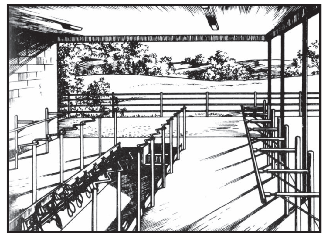
Figure 1: Herringbone Cowshed (Diagram showing 'angle-parking')

...and already the knowing animals are aware that we are not really at home in our interpreted world.