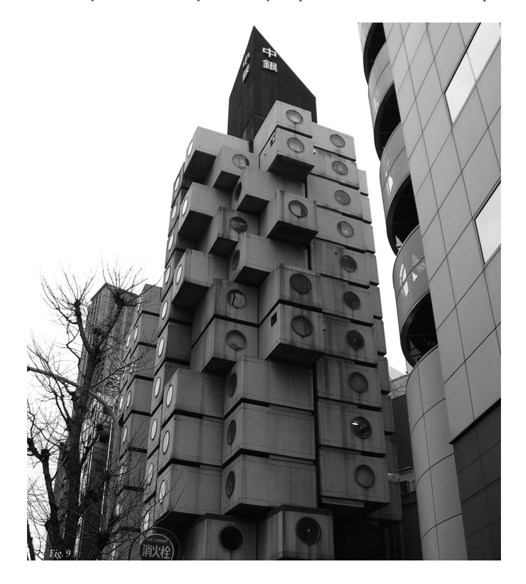
Fig. 9: Nakagin Capsule Building, Ginza, Tokyo.

Being at home ex- patriota thus requires a coexistence of three things. The first is the ability of a transitory abode to function as a repository of memories. The second is the ability to make use of the opportunities of any environment. The third is to develop a whatever singularity that cannot be entrapped by any one sense of belonging, that, paradoxically, is willing to risk being out of place to be at home anywhere. The Slinky House may not provide all of these, but it attempts