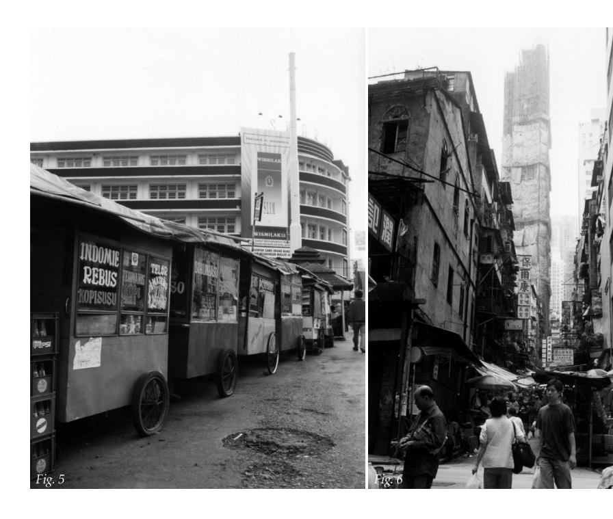
Fig. 5: Temporary food vendors, Bandung, Indonesia.