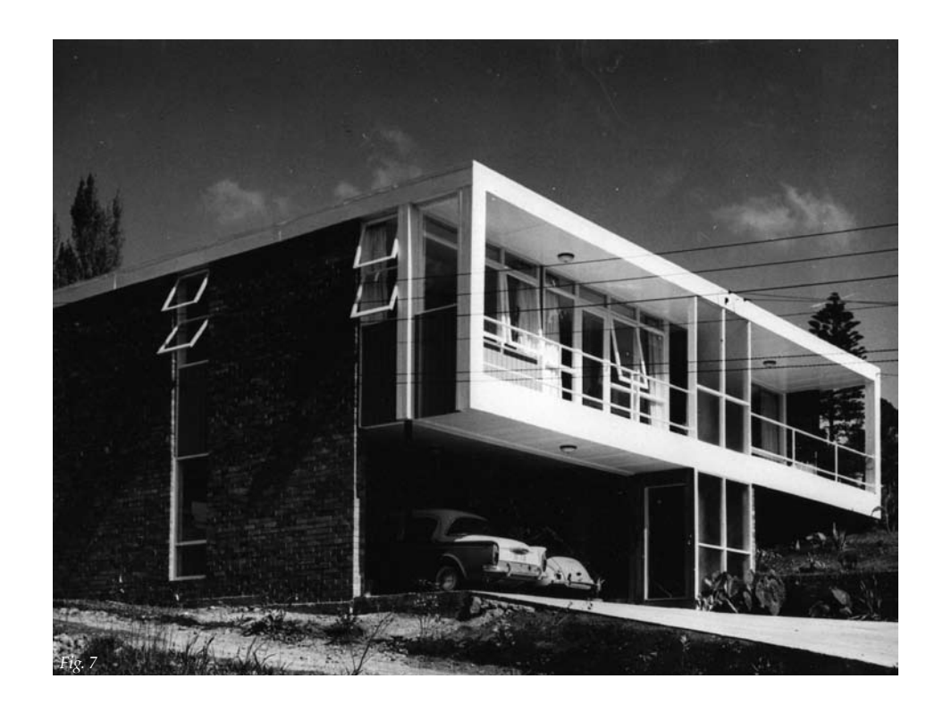
Fig. 7: Koningham House, 1960.