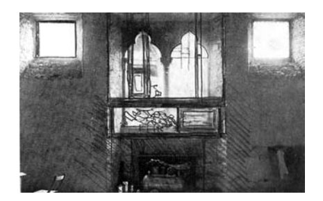
Fig. 9: Carlo Scarpa. Free hand ink drawing on photograph (1950s-70s). Detail of a window towards the courtyard. Sketch of the new interior window mouldings.