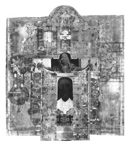
Fig. 7: Jirí Kolár, Cow having eaten up Canaletto, 1968. © Thames & Hudson. Fig. 8: Intercollage revealing the presence of the old within the new. © Federica Goffi.