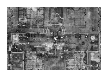
Fig. 5: Tiberio Alfarano, Iconographia, 1571. Detail of the central crossing of St. Peter's.