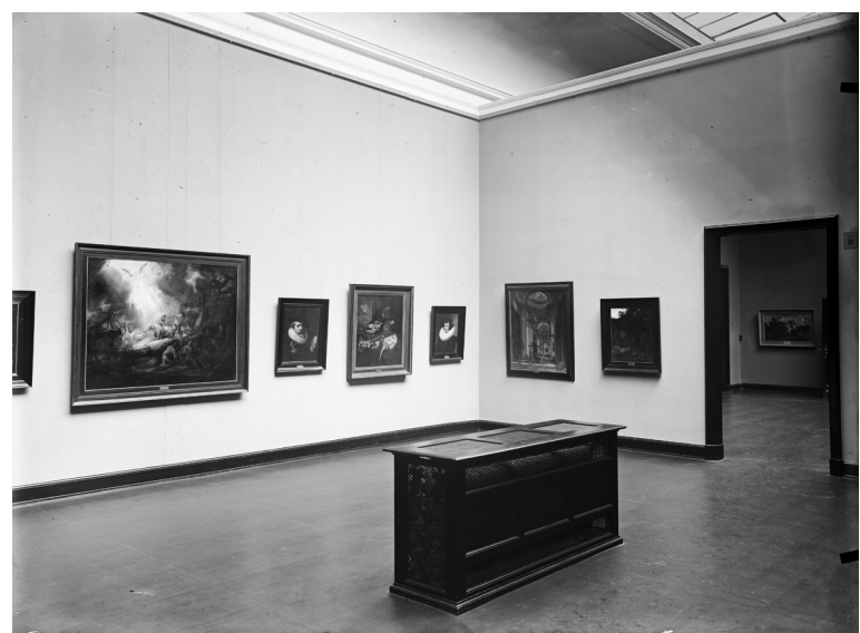
Fig. 3 Alexander Dorner. Room for Flemish Baroque art after its reorganisation.

Fig. 2 Alexander Dorner. Room for Dutch Baroque art after its reorganisation.