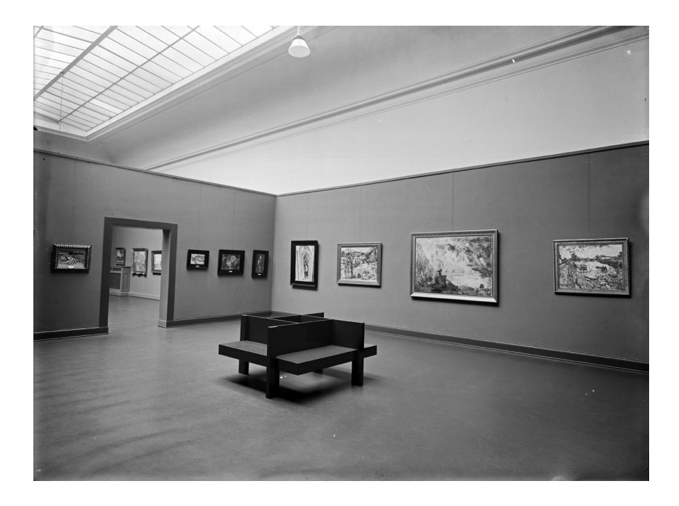
Fig. 4 Alexander Dorner. Custom-designed bench in the room for Expressionist art after its reorganisation.

Dorner's striking arrangements of a few paintings against a surface of continuous colour created a saturated ambiance that pervaded the room - something the visitor would absorb at a glance. This idea of a "total overview" is evident in Dorner's resolve to minimise distractions so that nothing would disturb the atmospheric impact of the space and the immediate formation of a mental image. Everything was kept simple - all elements of the room were subordinated to the larger logic of the atmospheric image. Black linoleum floors minimised the reflection of daylight. Simple custom-designed benches and modern chairs were executed in a black colour to visually merge with the linoleum floors. Designed as low as possible and positioned at the centre of the rooms and at maximum distance from the paintings, these furnishings minimised any interference with the viewing experience. Thus the entire horizontal plane was dematerialised and in its "blackness" almost receded from sight. In the vertical plane, windows were covered with opaque curtains in wall colours to regulate the light, avoid glare and keep out distracting views to the outside world as much as possible, so that these would not compete with the paintings (Cauman 1958: 90-91). With these calculated manipulations, Dorner attained complete control over the internal environment, encouraging the viewer's identification with the themed environment. In contrast, other manipulations were introduced to the opposite effect.