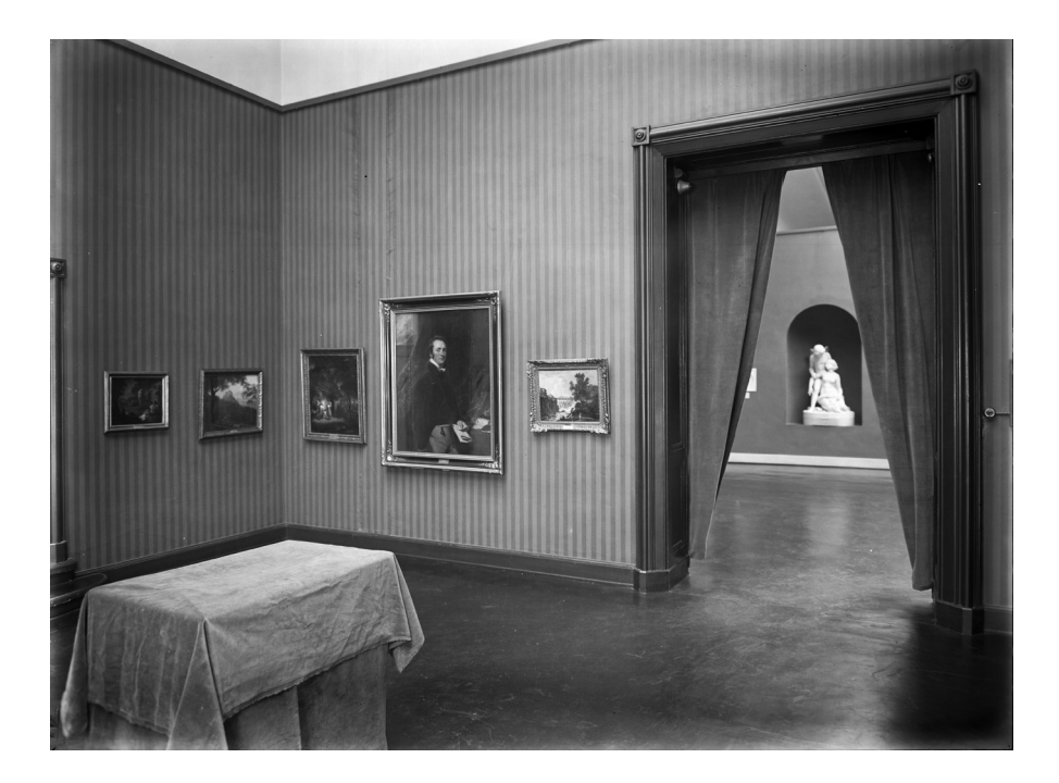
Fig. 6 Alexander Dorner. Ramberg Room after its reorganisation showing door curtains.

In addition to the colours and the information provided in guide books, other formal and informal devices underlined the respective distinctness or relatedness of rooms and their art. Between contrasting rooms, colour-matched door curtains separated different rooms as discrete milieus and these had to be drawn open upon leaving and entering (see Cauman 1958: 91). Interrupting the viewer's historic identification with a period and foreshadowing change, the curtains functioned as instruments for physical and mental activation. This rupture was augmented by small coloured posters with slogans which were mounted in door openings between rooms. These addressed the viewer directly and gave instructions: