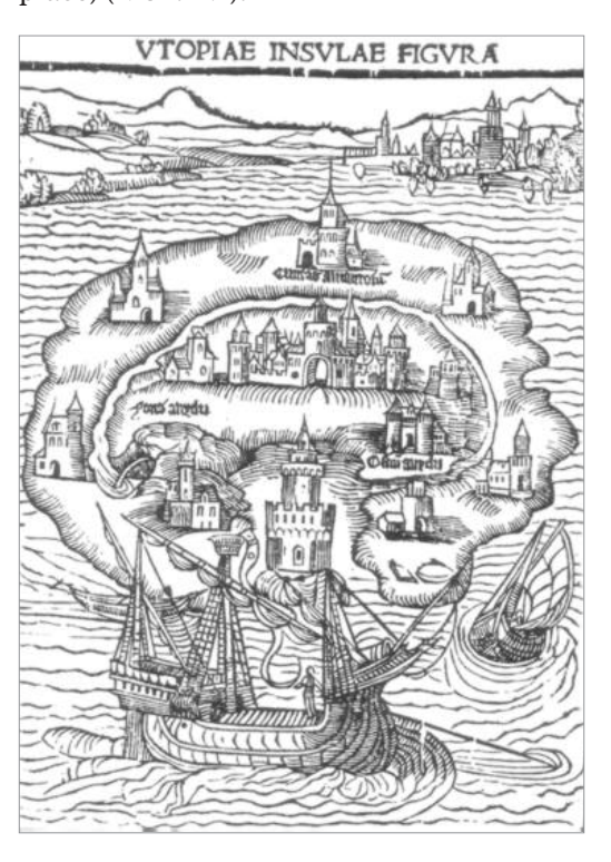
Fig. 3 Unknown (1516). Title woodcut for Utopis written by Thomas More.

Given the echoes of Moore's Utopia in Erewhon's title, what spatial-topographic resonances might the two fictions sustain? Moore leaves the location of the island, somewhere between Old and New Worlds, open. Louis Marin, reflecting on Moore's construction of an indeterminate, middle place, notes that "Utopia" is itself a middle locale between the Greek term outopia (no place) and eutopia (good place) (1984: xvi).