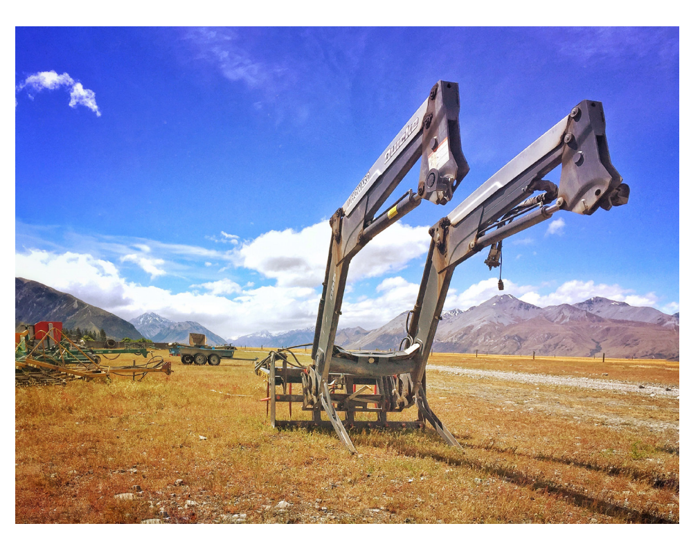
Fig. 1 Mesopotamia Station, Canterbury