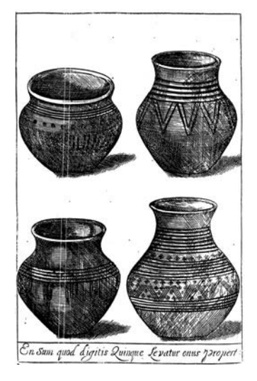
Engraving of the Old Walsingham urns.

The world is thus conceived as the domain of the remainder, where the contents of the world are left behind to be encountered by the latecomer. Primary amongst