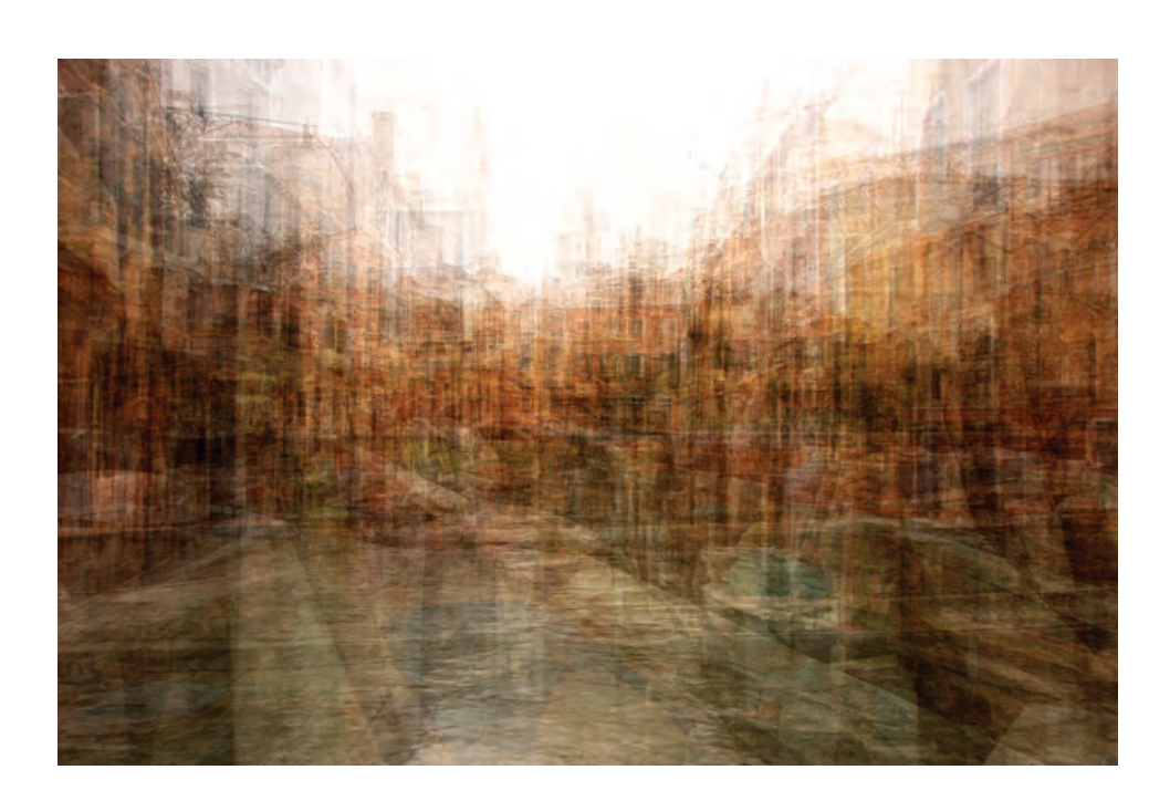
Fig. 3 Author (2014). A walk to Cannaregio Ovest, Venice, 3 November 2014 [Layered photographic composition]<sup>17</sup>