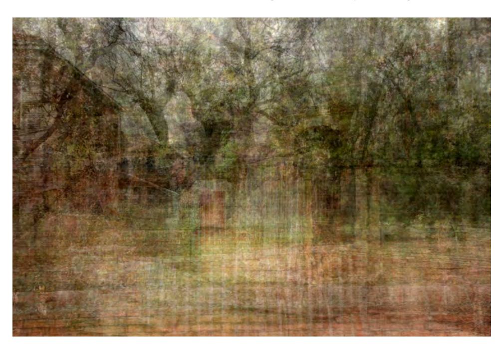
Fig. 1 Author (2014/2018). Left over spaces and surfaces in Cannaregio Ovest, Venice, 9-20 November [Layered photographic composition]

While these do not straightforwardly follow or apply Böhme's theory, these interpretations evoke a sense of atmosphere through blurry and dense images that result from the overlay of a series of photographs of a specific place or situation. They express an ambiance loaded with absences in accordance with what can be experienced on site. These images are composed of many translucent layers, corresponding to several photographs of a site or situation, superimposed on each other with reduced degrees of opacity allowing them to become simultaneously present.