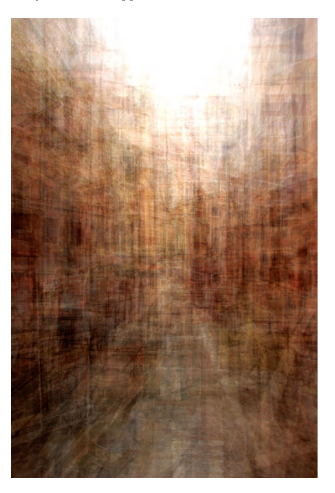
Fig. 2 Author (2014/2018). Walks in Venice, 3-20 November 2014 [Layered photographic composition]

The vertical orientation of this composition depends on the spatial proportion of the photographed environments: narrow streets, alleys, and vertically framed vistas. Despite the city's great spatial diversity, the image reveals some consistent features, such as how the light is distributed and the textures and colours of the deteriorating walls of buildings. The accumulation of images gives a painterly effect to the composition, as if through the dense air the masses of buildings of both sides can be seen gradually dematerialising in light.