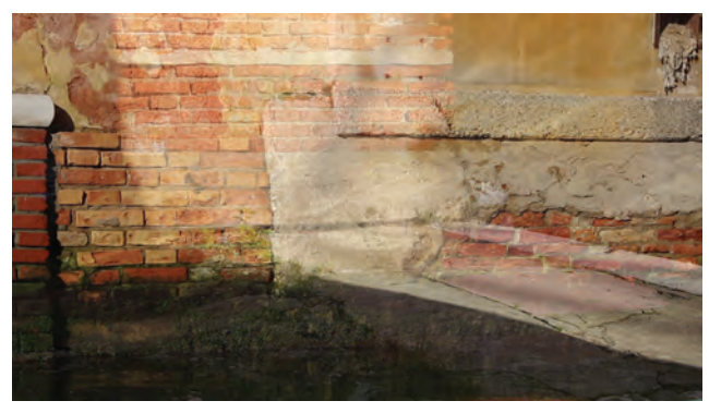
Fig. 5a-d Author (2014). Cannaregio Ovest, Venice, 20 November 2014 [Snapshots of layered video]

This form of representation does not respond to an understanding of the geometry of space and form. Sharp edges give way to the predominance of a sensory impression of light and colour, encompassing a temporal and spatial density and depth. In this way, the nature of the images resonates visually with Takemitsu's musical landscapes. The compositions suggest fading images seemingly in motion, balancing between a total opacity and the almost absolute transparency that allows them to reverberate together, interweaving presence and absence. Beyond still images, Takemitsu's relation between sound and silence to express ma can be furthered through an exploration of moving images, working more directly with the dimension of time.