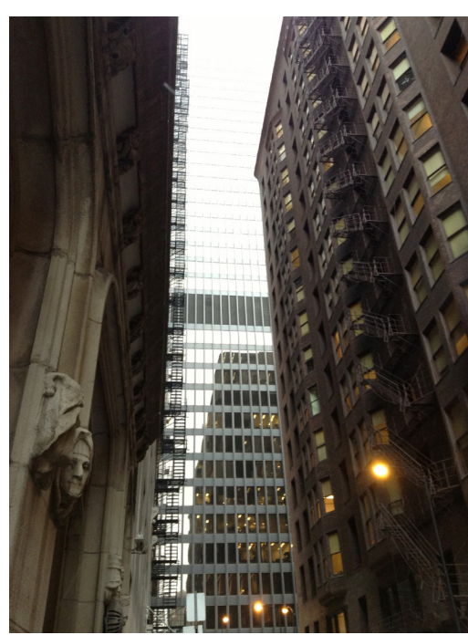
Fig. 4 Gerard Reinmuth (2020). Federal Centre, Chicago (1959) [Diagram redrawn after plan by Mies van der Rohe]

Fig. 5: Desley Luscombe. Federal Centre, Chicago [Photograph