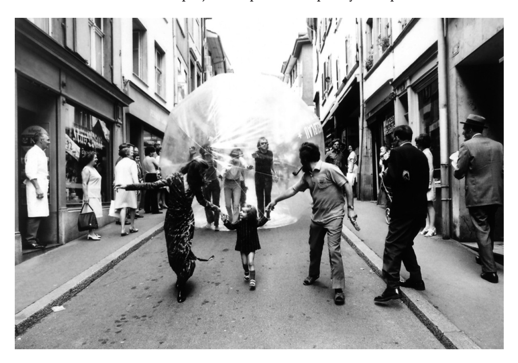
Fig. 1 (1971). Coop Himmelb(l)au's Restless Sphere [Photograph]

By positing architecture as a type of mobile intervention into the city, Coop Himmelb(l)au claim a place for experiential or phenomenological experimentation, one where architecture opens onto forms of life predicated by insistent movement and a certain remove from the built. So, while the identification of this project appears in the first instance to be the sphere as object, what was at stake conceptually was the question of experimentation linked to movement