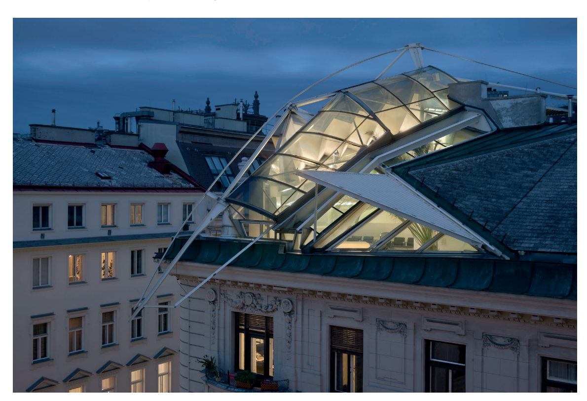
Fig.2 Coop Himmelb(l)au's Falkestrasse Rooftop Remodelling, Vienna, Austria [Photograph]