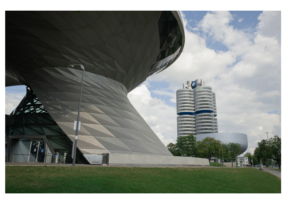
Fig. 3 Eugen Gritschneder (2020). Coop Himmelb(l)au's BMW Welt, Munich, Germany [Photograph]

This return to the architectural object is not to suggest a diminished work in fact the project received a largely positive reception due particularly to its eschewing of a then prevalent, architectural postmodernism. Here was a project that refused the reuse of historical styles and ornamentation, pursuing innovation instead via a stylistic decontextualisation.<sup>2</sup> Anticipating the emergence of deconstruction in the late 1980s, Vidler noted that the addition provides a space for including "a population estranged from their once comfortable houses and seeking shelter beneath less historically determined roofs" (2003: 188). Thus, the incorporation of this project into a new canon named "deconstruction" signalled a transformation in what counted as an architectural object. With the subsequent increase in digital design concepts and tools from this time, what came to predominate was form-creation itself. Hence, deconstruction in architecture, and this project's contribution to it, was instrumental in securing architecture's identification with the object. The object may do different work, but it is still an object. This equating of architecture and the object paralleled the financial consequences of Coop Himmelb(l)au's evolution into a mature commercial practice, a practice capable of producing the BMW Welt building, itself designed immediately prior to the onset of the GFC (see Fig. 3).