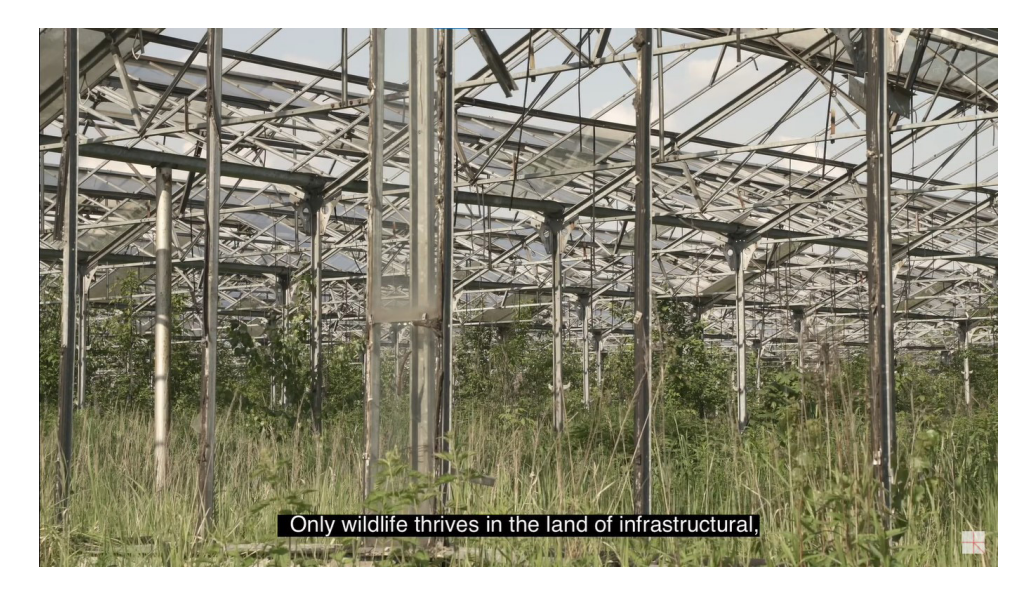
Fig. 2 Luciano Brina, Andrey Tetekin, Yu Gong (2020). Abandoned greenhouses, pharmakon landscape. [Film still: Andrey Tetekin, 2020]

Russia has the possibility to shift its intra-border colonialism—both in terms of metabolic output and added value allocation—towards becoming an internationally-funded, planetary ecological donor (2017: 18–43).