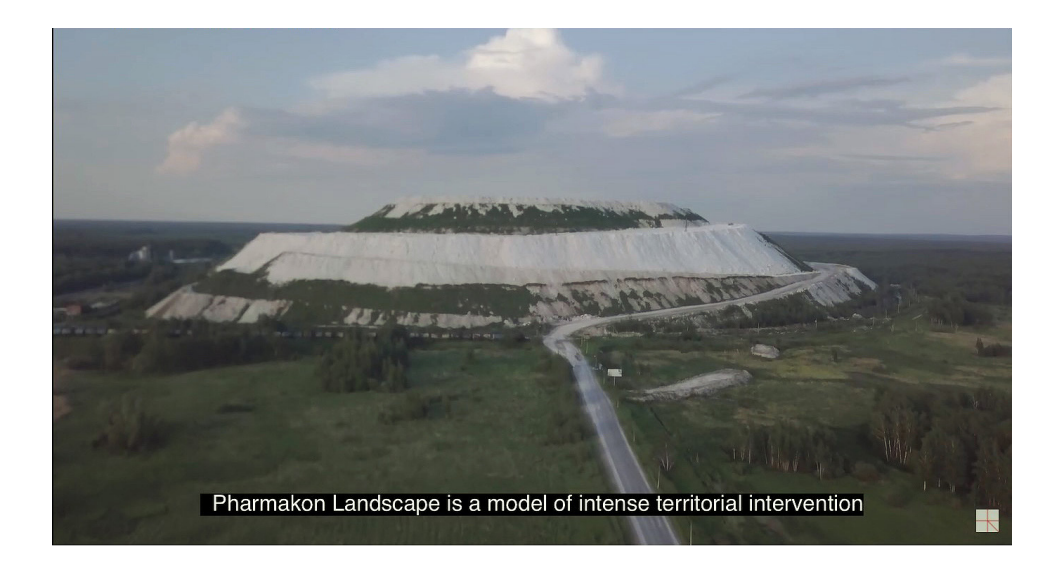
Fig. 1 Luciano Brina, Andrey Tetekin, Yu Gong (2020). Artificial hill of by-products from the iron smelting industry.

country every place but the main cities is thought as peripheric, one might be facing the largest dumpster on the planet, as Russia's total area compromises 11.48% of the earth's land mass. There is a more precise category for this vast, for-saken landscape: it is called the inner periphery .