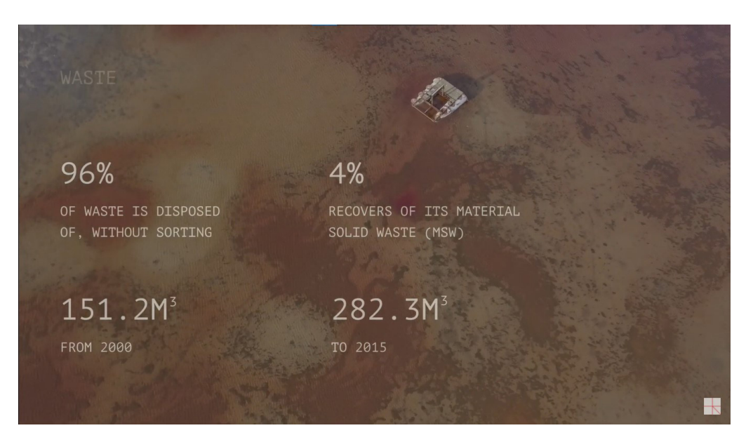
Fig. 4 Luciano Brina, Andrey Tetekin, Yu Gong (2020). Pharmakon landscape. [Film still: Luciano Brina, 2020]

The absence of concrete planning regarding waste has resulted in a complete misallocation of poison within the inner periphery, which has led to a collapse of its metabolic layer. Pharmakon landscape aims to restore this layer by establishing an everyday geoengineering practice based on systematic waste zoning and classification, in order to take advantage of the geo-bio-chemical composition of media that traverses its soil, its trees, its inhabitants, and its infrastructure.<sup>1</sup> Accelerated and intensively planned pollution results in an equally accelerated metabolic recomposition towards GHG reduction, soil nurturing, and energy production.