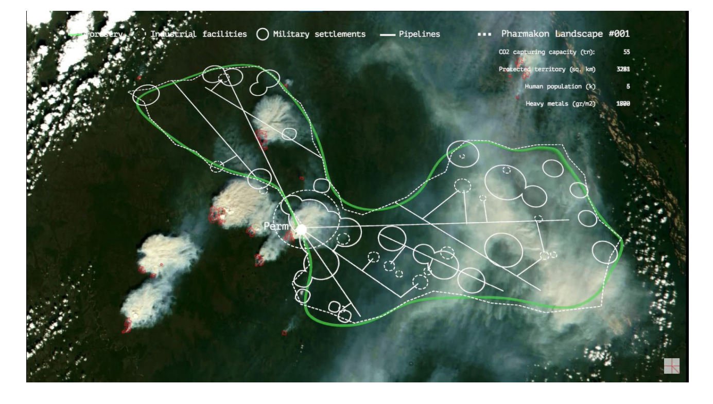
Fig. 5 Luciano Brina, Andrey Tetekin, Yu Gong (2020). Pharmakon landscape. [Film still: Luciano Brina, 2020]

After all, this is the social, economic, and territorial background of the inner periphery: decay, stagnation, emigration, pollution, obsolescence, aging, remoteness, solitude, defunding, degrowth, and extremely low temperatures. How might a pharmakon landscape reverse or at least propose an alternative, more qualitative scenario for this forsaken territory and its inhabitants?