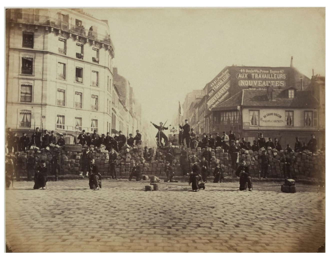
Fig. 8 Barricade in the Chaussée Ménilmontant (1871).

Traugott's critique is that Communard barricades lacked spontaneity, but Blanqui would have seen their failure as a matter of insufficient organisation. For him, rigorous order was the only way emergent acts of rebellion could be brought together into a coherent revolution that would culminate in a new social reality. In Instructions for an armed uprising he set out a military command structure, and described how this would enrol bystanders, disciplining and synchronising their action. Somewhat optimistically, he specified: "As soon as the citizens rush into the streets in response to the uprising, arrange them into battle formation with two rows" (1886). In place of "ten thousand isolated individuals" improvising at once, the central problem of the revolution as Blanqui saw it was how to turn them into modular units of a single construction, like the stones of one of his