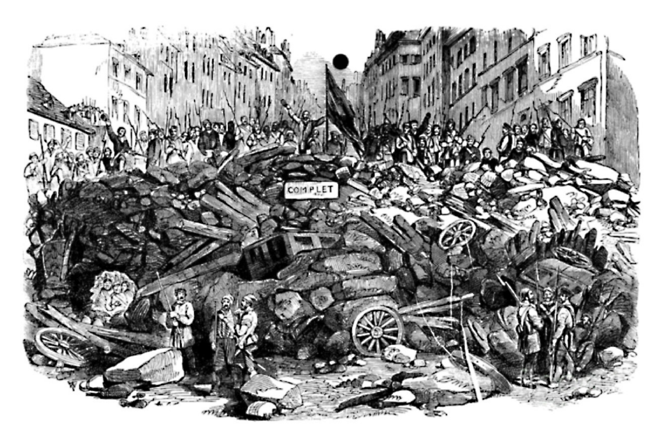
Fig. 5 Barricade in the Rue du Faubourg Saint-Antoine (1848). [Engraving, Ilustrated London News]

Lafargue's image suggests a new reading of the barricades, improvised street blockages that had long featured in Parisian urban unrest. The excess of bourgeois things spilled chaotically into the street during times of insurrection. Interiors were tipped outwards: