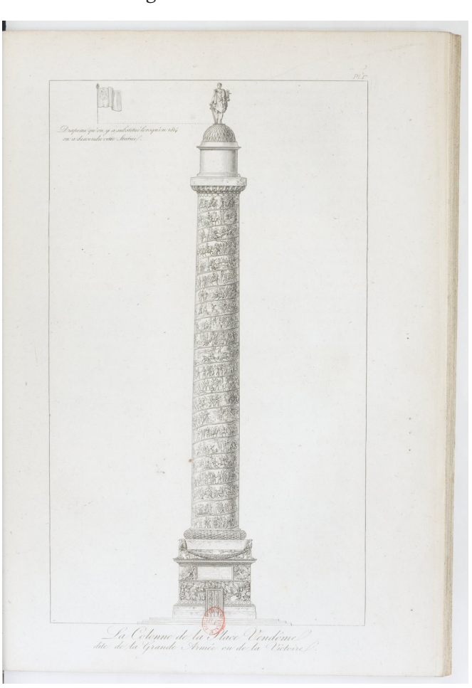
Fig. 1 Ambroise Tardieu (1833). The Vendôme Column. [Engraving, Bibliothèque Nationale de France]

There were few attempts at symbolic festivities under the harsh circumstances of the Paris Commune. There was, however, at least one staged event: the Vendôme Column was torn down. The column (Fig. 1) was originally completed in 1810 to commemorate Napoleon's 1805 victory over the Russian army at Austerlitz. Modelled on the column of the Roman emperor Trajan, its sequence of four hundred bronze relief plates depicted the events of the battle, crowned with a pseudo-classically dressed figure of the emperor. Rome had shaken off tyrannical kings to become first a republic and then an empire; the Vendôme column asserted a parallel story of the revolution, culminating with the emperor. The column literally "narrat[ed] France", asserting linear historical time in a single frieze spiralling upwards (Smith, 1996: 153). To follow its story, one would have to circle the column repeatedly, eyes rising until the images became too small to discern from the ground.