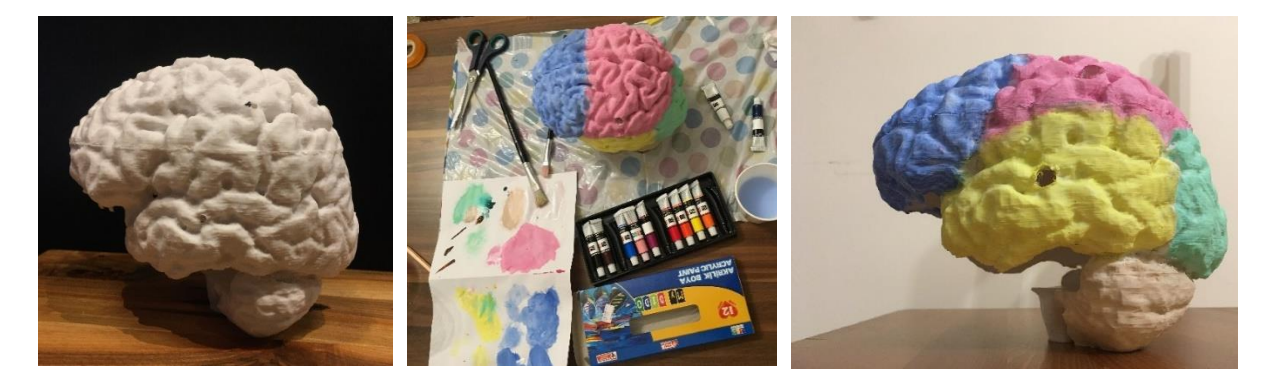
Figure 1. 3D design, painting of the brain model, drilling of the lobes

The 3D brain model, the main component of the designed model, was obtained with a nature-friendly material called PLA using a 3D Printer. Using acrylic dye, the brain lobes were painted in different colors based on the corresponding picture in the biology textbook of the Ministry of Education. A hole was drilled into each lobe of the right hemisphere of the brain using a drill (Figure 1).