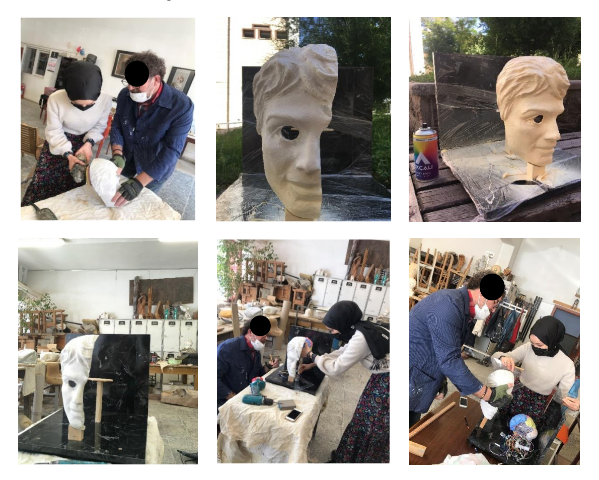
Figure 3 . Creating the mask and table 2.2.4. Adding QR code to the model

The face mask designed for the front lobe of the brain, was prepared in a sculpture workshop. Firstly, the mask was modeled from clay, then placed in a plaster mold and a fiber casting was performed. The face mask was then sprayed with paint. Two square boards of 40x40 cm were attached to each other at a 90^0 angle to form the table. Wooden pieces to enable the 3D brain and face mask to be positioned were placed on the table. The mask and brain model were fixed on these parts with a drill. Sensors were attached to the relevant parts of the mask using a silicone gun. Holes were drilled in the 4 corners at the base of the table and the switches were added (Figure 3).