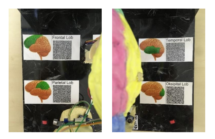
Figure 4. Adding Qr codes and pictures to the model

2.2.5. Incorporation of user instructions for the model