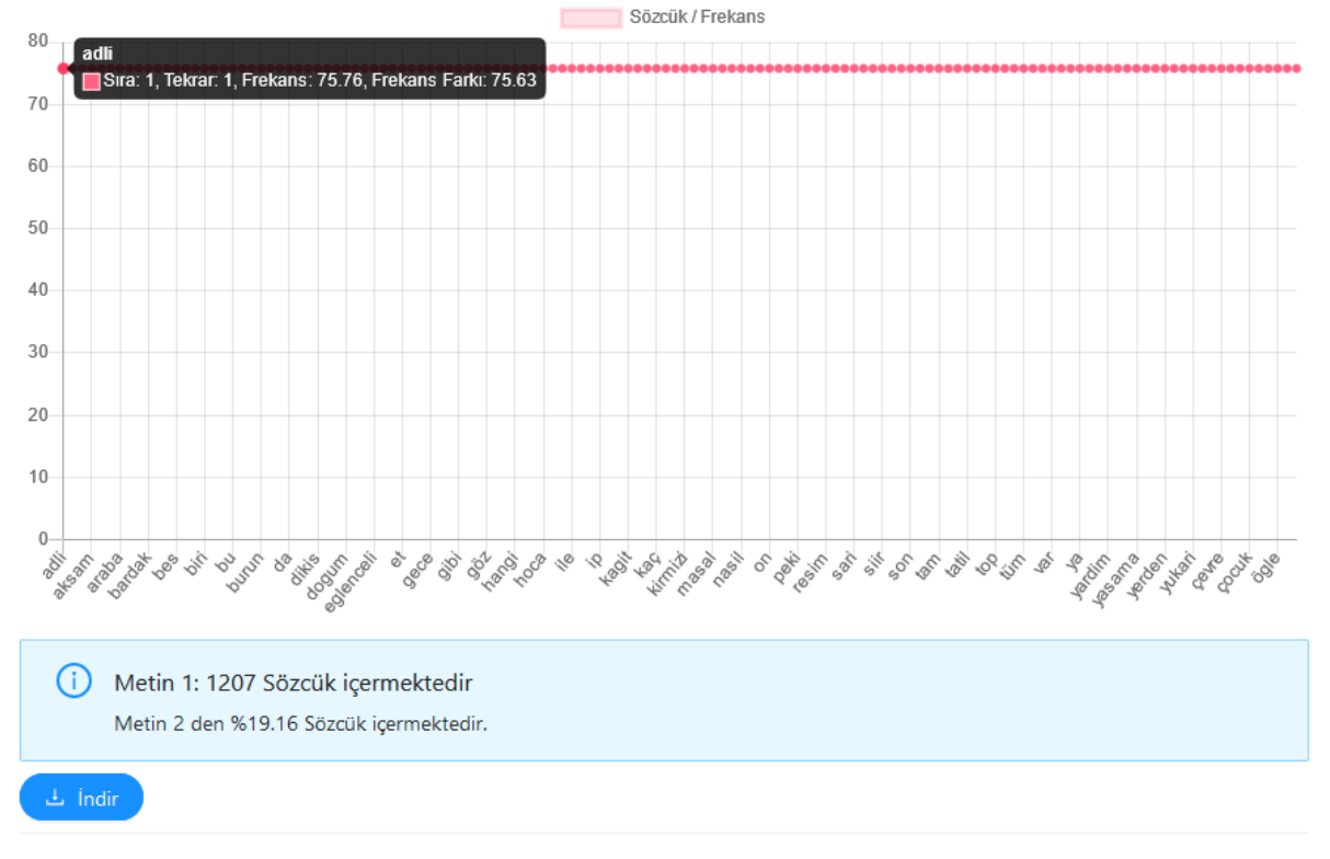
Figure 3. Frequency Graphic Distribution Display of the Interface

Users can choose the encoding option that shows the letters correctly after uploading their text and collections in .txt format with the Choose File option and the "Choose File" option. After the files are uploaded to both Text fields, the analysis can be performed with the Submit button.