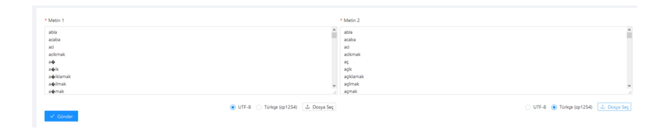
Figure 2. Character Encoding Preference view of the interface

In the LexiTürk interface, which has a plain design, Turkish (cp1254) and UTF-8 character encodings are used as the industry standard. The Turkish character encoding formats are mainly used for Turkish in the fields expressed as Text 1 and Text 2.