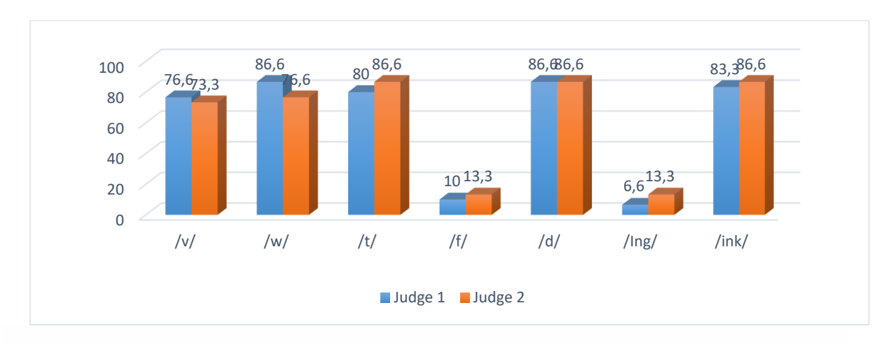
Figure 1. Mispronunciation of English problematic consonantal sounds

The next problematic sound for Turkish EFL learners was /ð/. The most substitution was /d/ (86.6%) as in the words 'southern' which is pronounced as /sʌdən/, 'the' which is pronounced as /di:/, and 'their' which is pronounced as /dɛə/, Both Judges came up with the same decision as can be seen in Table 3 below. This is due to the fact that these two consonants do not exist in Turkish, therefore, Turkish EFL learners tend to produce either /t/, /f/ or /d/ sound instead. They find it easier to pronounce this way and they say that feel strange to the audience. Hence, they only replace the sounds with /t/, /f/, /d/ and pronounce the words. As to the English consonant sound /ŋ/, most of the participants (83.3%) regarding the first Judge's decision mispronounced it as in the words 'something' which is pronounced as /'sʌmtink/ and 'think' which they pronounced as / \theta ink/. According to the second judge, similar to Judge 1, 26 participants (86.6%) mispronounced / \eta / sound. As can be seen in Table 2, for Judge 1, only 6.6% of the participants pronounced / \eta / sound as /Ing/ and according to the results of Judge 2, 13.3% of them replaced it with /Ing/. The results were followed by major problematic vowels and diphthongs. The frequencies and percentages of participants' difficulties in pronouncing English vowels and diphthongs were analysed. The results are presented in Table 3 below. As