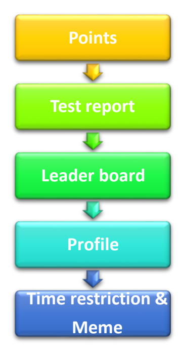
Figure 2. Game elements/game components ranking.