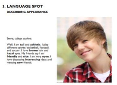
Figure 2. A photo of Justin Bieber

From the examples of printed materials found in the course book, it was noticed that the institution gave enough models for students not only as an introduction but also as the students' task. From the observation, the teachers usually discussed the tasks quickly by making short whole-class discussion and directly moved to the next task, following the course book. First, Figure 1, the authentic printed material is in the form of an article survey. It was used for Activity 1: Appearance, the task was reading the article and discussing the questions. The students then presented the result of the discussion.