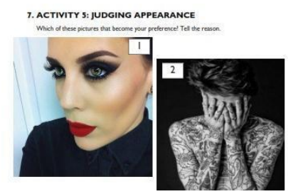
Figure 3. Photos of a woman and a man

preference from 6 photos, and giving the reason why they like and dislike them. The language features are provided below the photos, so the students could learn from them.