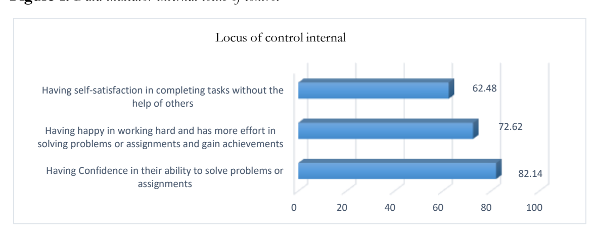
Figure 1. Data indicator internal locus of control

The research was conducted during the Covid-19 pandemic, where learning interactions took place online, so the data collection process was also carried out online by utilizing various learning applications or social media. The Covid-19 pandemic has brought many changes to the learning process that has been done face-to-face. This condition raises a variety of student responses due to changes in routines which of course require a long adaptation to new habits following online learning. Likewise, the research process carried out must adapt to the conditions of students whose activities are carried out by distance learning. Researchers distributed questionnaires to students in the form of a Google Form. The questionnaire contains indicators of aspects of internal locus of control and external locus of control. The results of the Google form questionnaire data analysis provided by students are presented in Figure 1.