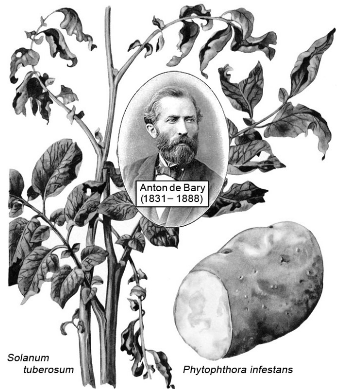
Fig. 1: Photograph of the founding father of experimental plant pathology and his research object, potato plants ( Solanum tuberosum ), infected by the oomycete Phytophthora infestans . The name “infectious plant destroyer” for this pathogenic fungus was coined by Anton de Bary in 1876.

Anton de Bary (Fig. 1) was born on the 26th of January 1831 in Frankfurt-Main, Germany. From 1849 to 1853 he studied medicine at the Universities of Heidelberg, Marburg and Berlin, where he earned his academic degree with an unpublished dissertation on a botanical subject. The title of this work of 1853, De plantarum generatione sexuali , indicates the primary interest of the young physician: plants and related sessile organisms. At the same time, the 22-year-old junior scientist, who was already an experienced plant and fungi collector, published his first monograph. In these Researches on the