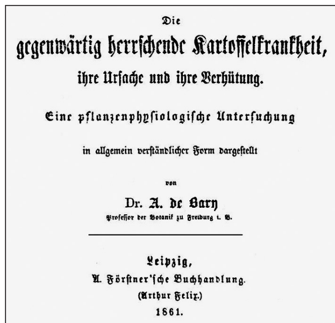
Fig. 2: Title page of Anton de Bary's monograph on the potato late blight. This book also contains recommendations how to prevent the spread of this devastating plant disease.

In a recent article entitled “Genome evolution in plant pathogens”, fungus-like parasites (oomycetes), such as the potato blight pathogen Phytophthora infestans , and their infection strategies are described