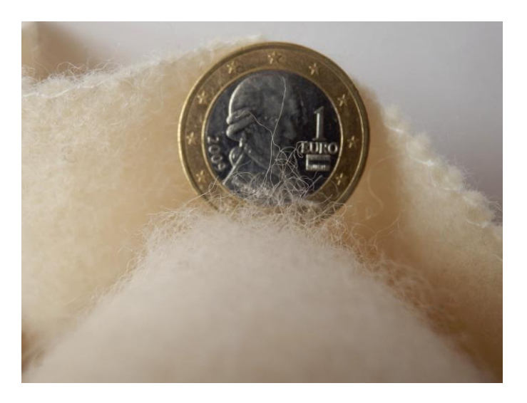
Fig. 1. Photograph of the Oxford fabric showing its fleecy texture. The coin used as a size marker is 23.3mm in diameter