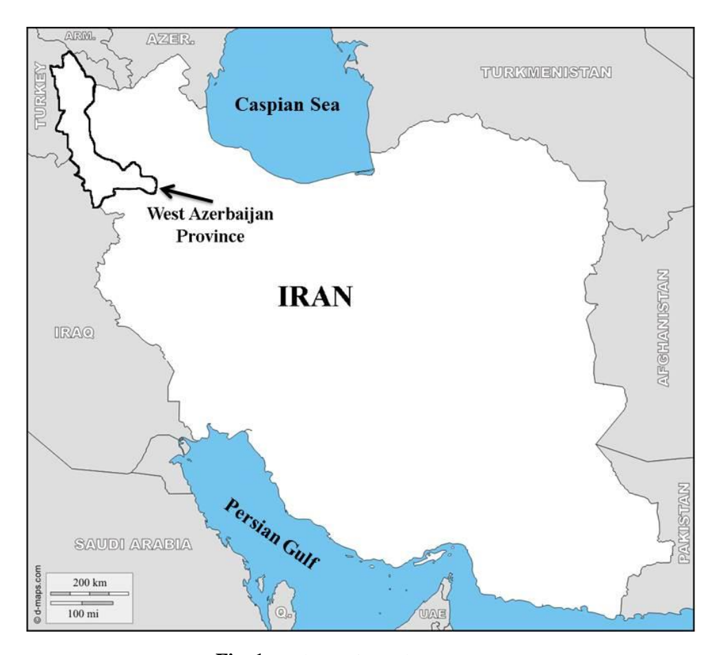
Fig. 1. Study area in northwestern Iran