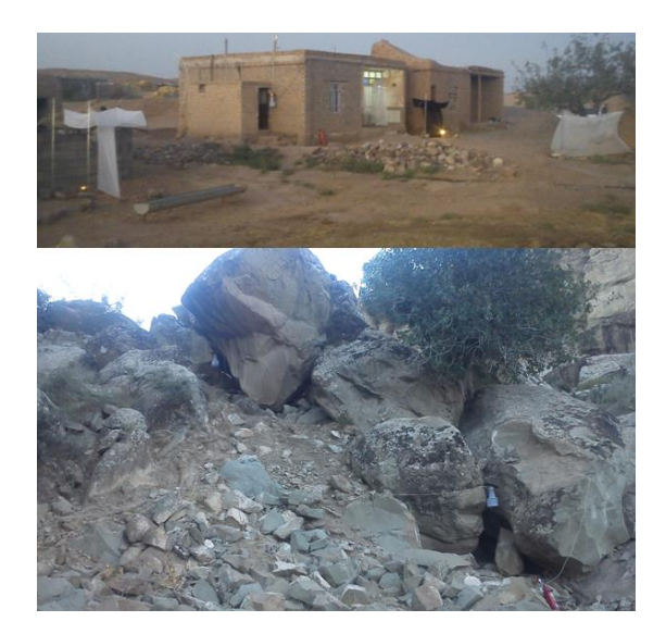
Fig. 2. Different collection methods used for sampling of phlebotomine sand flies, North Khorasan Province, Iran, 2016. Above: white and black Shanon and animal baited traps in location C. Below: Light trap and light trap baited with Carbon dioxide gas in location A