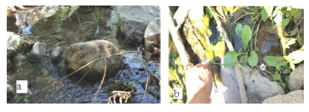
Fig. 2. (a, b) Two sampling sites, Aghbolagh River, East Azerbaijan, Iran