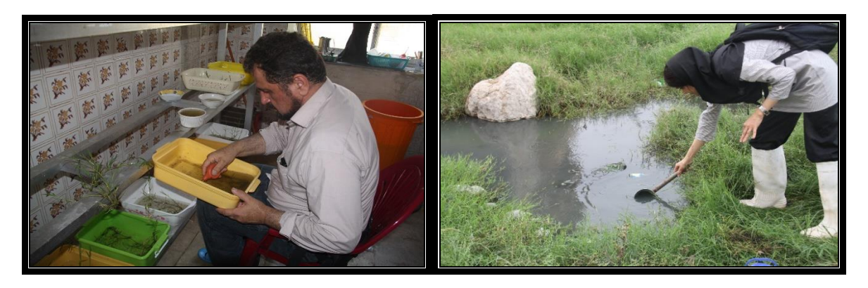
Fig. 2. Collection of immature Culex quinquefasciatus from natural breeding places with floating Bermuda grass and subsequent establishment in the insectary of Bandar-Abbas Health Training and Research Station, Persian Gulf littoral, Iran