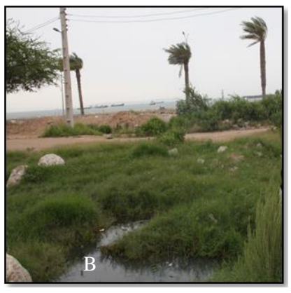
Fig. 1. A. Satellite map of Suru location, Bandar-Abbas Port, Hormozgan Province, Persian Gulf littoral, Iran b. Ground landscapes of the breeding places of Culex quinequefaciatus in study area