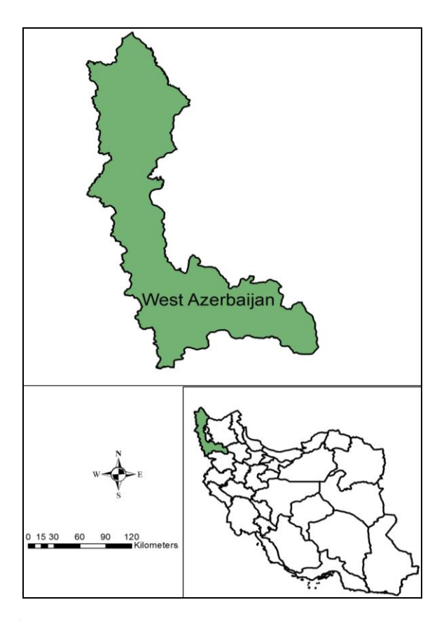
Fig. 1. The status of study area, West Azerbaijan Province in Iran