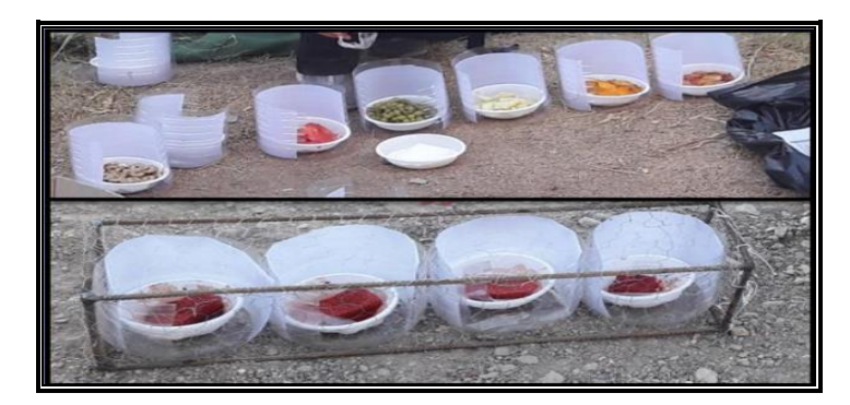
Fig. 2. Baiting traps for attracting sand flies