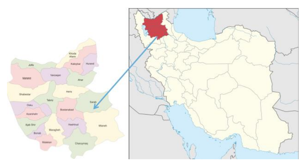
Fig. 1. Map of studay area, Sarab County, East Azerbaijan Province, Iran

Table 4. The results of hot-spot and autocorrelation analysis of tick species in Sarab County, East Azerbaijan, north-<br/>west of Iran, 2018–2019