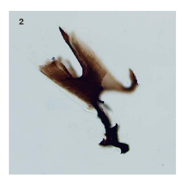
Fig. 2. The cephalo-pharyngeal skeleton of second instar larva isolated from nasal secretions suction of a 5.5-year-old girl, 2010, Iran (Original)