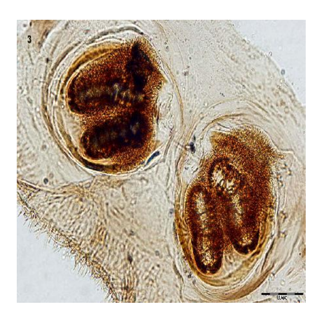
Fig. 3. Posterior spiracles of the second instar larva isolated from nasal secretions suction of a 5.5-year-old girl, 2010, Iran (Original)