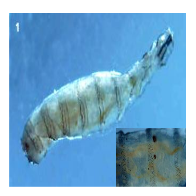
Fig. 1. The second instar larva isolated from nasal secretions suction of a 5.5-year-old girl, 2010, Iran. Spinous band indicated just around the right down corner (Original)