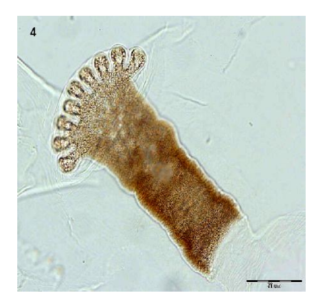
Fig. 4. Anterior spiracle of the second instar larva with 9 lobes isolated from nasal secretions suction of a 5.5-year-old girl, 2010, Iran (Original)