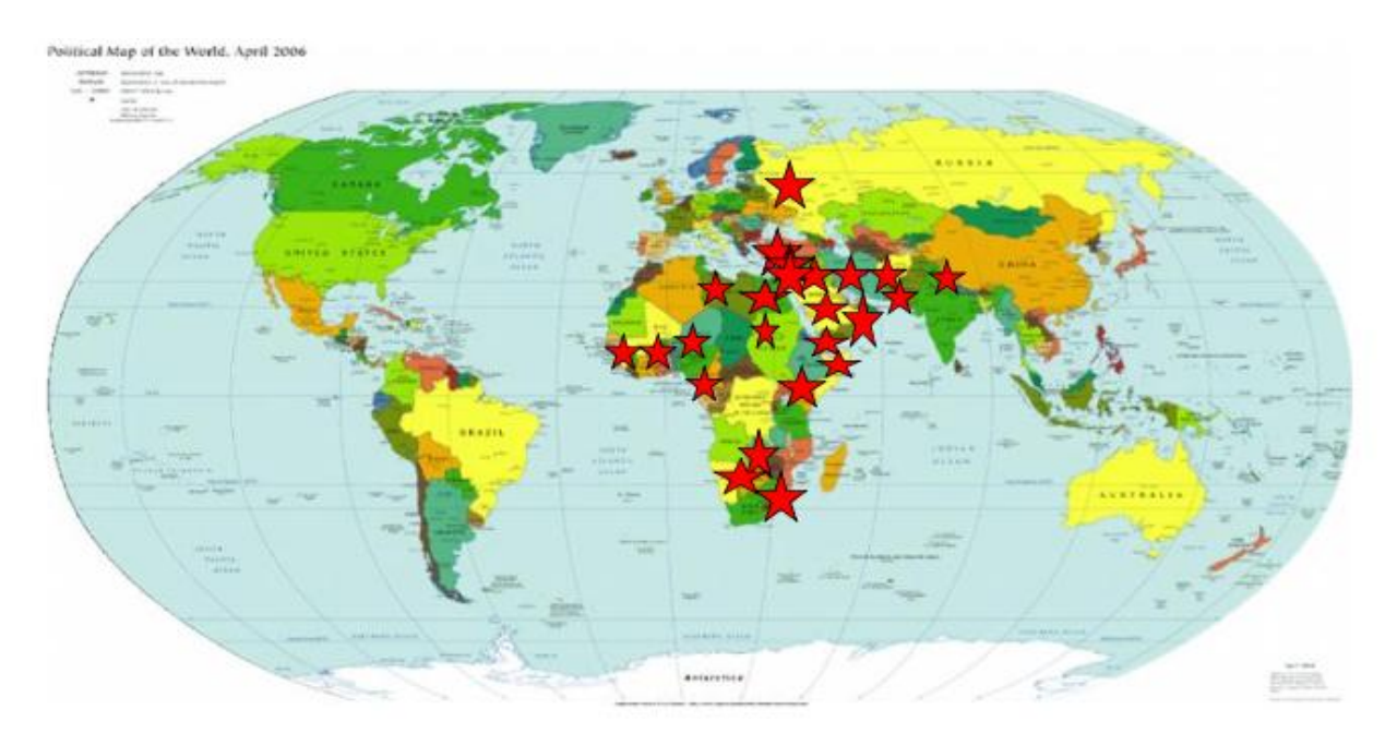
Fig. 3. Global distribution of participants from malaria courses