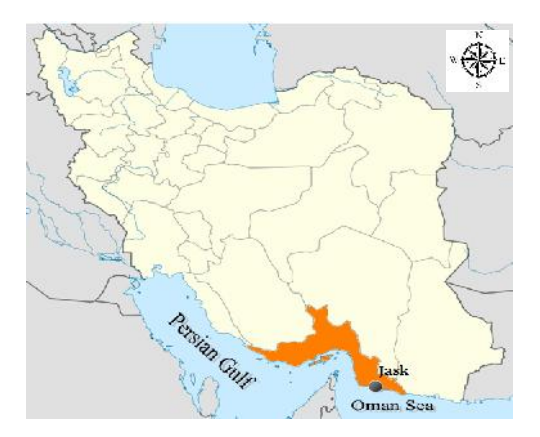
Fig. 1. Location of Jask County in Iran

health center as soon as their child feels feverish, but just 35.7% used ITNs during last year (Table 3).