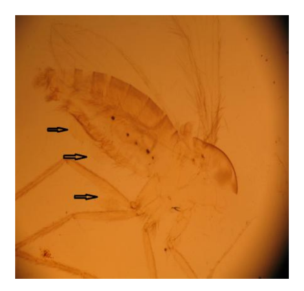
Fig. 2. Abdominal scars left on female Phlebotomus papatasi which was infested by three Eustigmaeus johnstoni mite, Iran, 2010