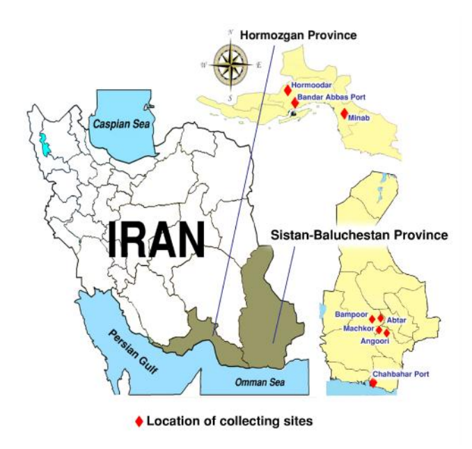
Fig. 1. Location of Anopheles stephensi collection sites from malarious areas of Iran, 2011