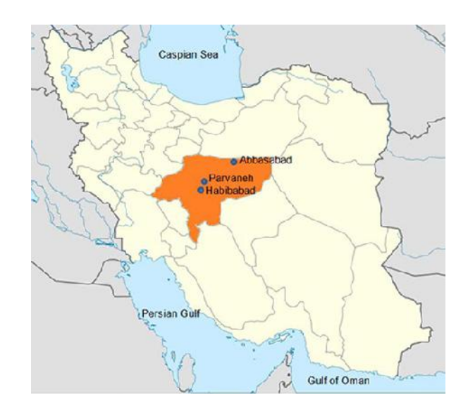
Fig.1. Geographical location of Abbasabad, Habibabad and Parvaneh-Aliabadchi in Esfahan Province, central Iran

Anti P. papatasi serum from R. opimus reacted similarly with SGL of Leishmania infected and non-infected sand flies. Six antigenic bands from 14 to 44 kDa and one faint band of 68 kD were recognized. The serum reactions differed only in intensity with non-infected flies recognizing a 22 kDa and a 24 kDa antigen more strongly than infected flies (Fig. 3d).