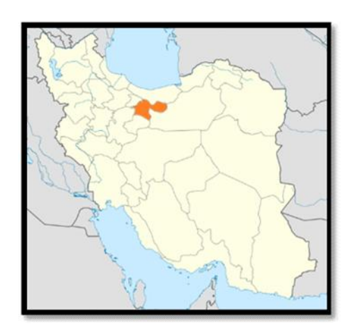
Fig.1. The map of Iran and location of Tehran city

utes) had lowest to highest LT50 (Table 2 and 3). The result also showed that among these insecticides, Lab strain is susceptible to Lambdacyhalothrin, deltamethrin, cyfluthrin and resistance to DDT according to WHO criteria that suggested (98-100% mortality indicates susceptibility, 90-97% mortality indicates resistance candidate (more investigation is needed or requires confirmation of resistance with other methods) and <90% mortality suggests resistance) (WHO 2013). And also cyfluthrin with LT50=45<sub>Sec</sub> and DDT with LT50=3005 were the most and least effect (Table 1,3 and Fig. 2,3).