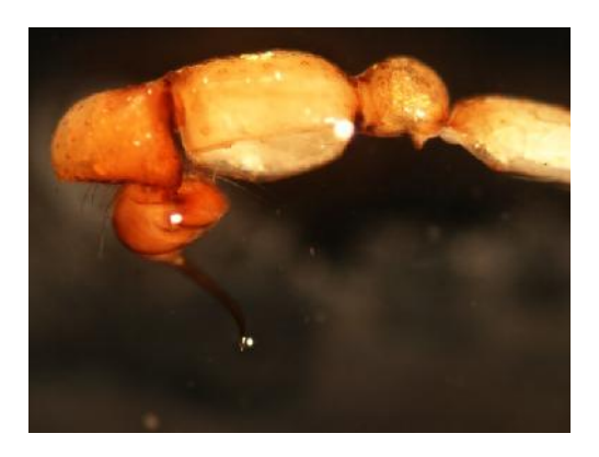
Fig. 3. Loxosceles rufescens, male palpus, lateral view