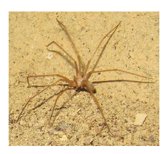
Fig. 4. Loxosceles rufescens, male, Charkhab Cave