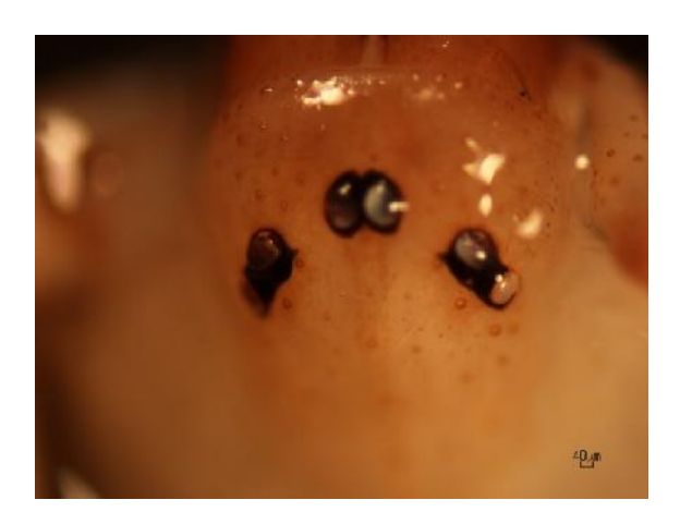
Fig. 2. Loxosceles rufescens, arrangement of eyes in three pairs