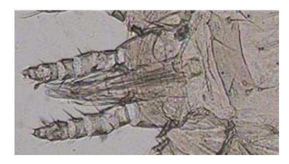
Fig. 2. Microscopic photograph showing sternal plate of Ornithonyssus. bursa