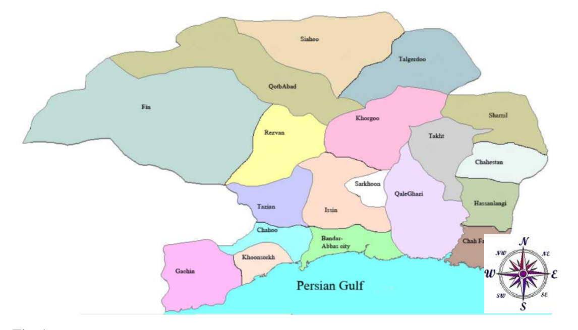
Fig. 1. Malaria registration centers of Bandar Abbas, Hormozgan Province, Iran, Bandar Abbas County