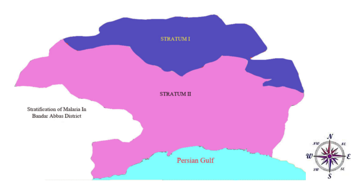
Fig. 3. Malaria stratification in Bandar Abbas, Hormozgan Province, Iran 2004–2008, Bandar Abbas County