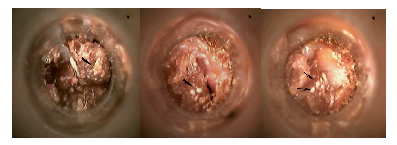
Fig. 1. Otoscopic view of otitis external due to ear mite. Note the small and white mites with dark brown cerumen and debris (black arrow)

ministered topically every week for a month. A combination of topical antibacterial and antifungal agents (otosporin) was administered daily for one week as well. All puppies were re-evaluated after one month and there was no sign of mite infestation in otoscopic and microscopic examinations.