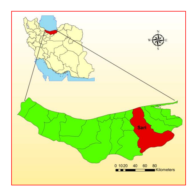
Fig. 1. Geographical poistion of the study area in north of Iran