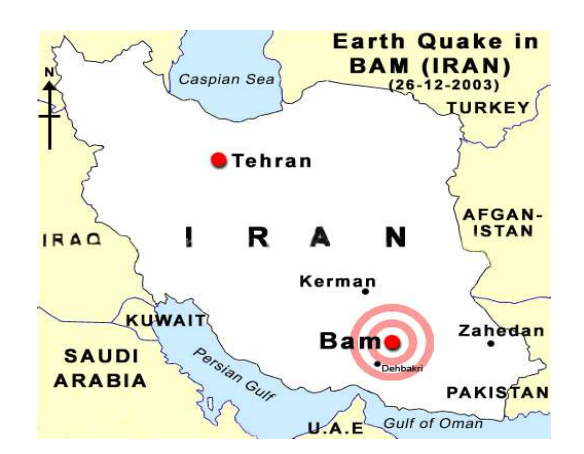
Fig. 1. Dehbakri Country, located in Bam District, Kerman Province, south of Iran

Dehbakri County is located at the foothill of Jebal-Barez Mountain and 48 km far from southwestern of Bam District (Fig. 1). The population of Dehbakri County was 2470 in 2009. The topography of these localities is foothill with the mean altitude of 2000 m above sea level. This area has a semi-desert climate, temperate at summer and cold at winter. The mean of monthly maximum and minimum temperatures were 40 °C and -5 °C in July and Dec respectively. The total annual rainfall was 220 mm. The minimum and maximum of monthly relative humidity were 45% and 92% respectively in July and Jan.