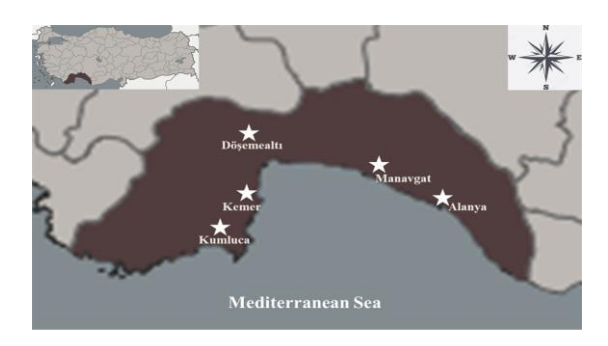
Fig. 1. Culex pipiens collection sites in various districts of Antalya Province, Turkey in 2017