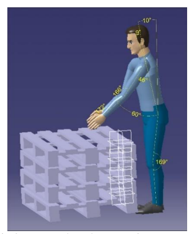
Fig 3. Proposed work posture improvement

From the results of calculations that show the results so that immediate action is taken, the researchers provide solutions for work aids that can ease the burden on workers, which can be seen in figure 3.