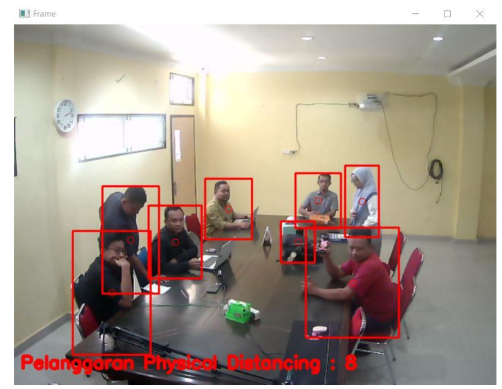
Fig. 3. The results of the detection in the room detected by the violator

In the direct video camera testing process, it will be deployed using NVIDIA Jetson Nano. The test is carried out in a closed room. The following shows a sample image that has been tested using the YOLO Tiny V3 method with a set Euclidean distance value of 100 pixels in Figure 3. This test aims to determine the processing speed of object detection (Huang et al., 2018).