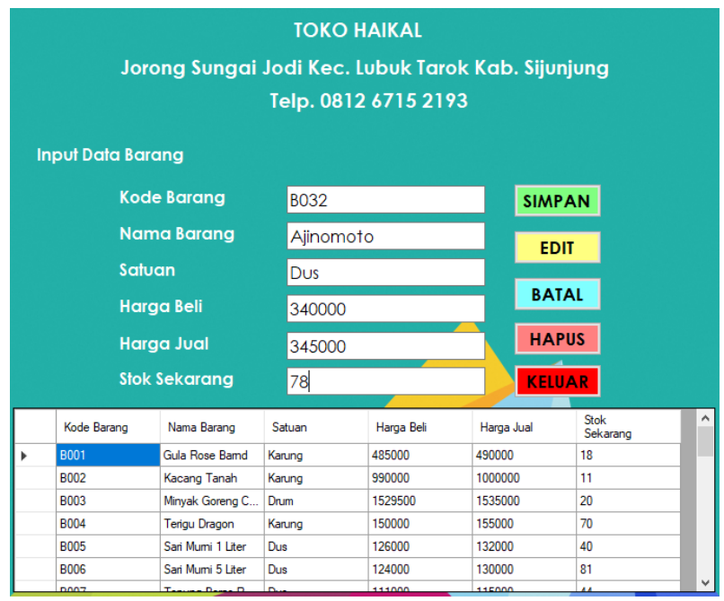
Figure 4. Input Item Data display

In the ROP analysis view, data incubation includes ROP code, item code, item name, lead time, need, and safety stock. For more details can be seen in Figure 5. below.