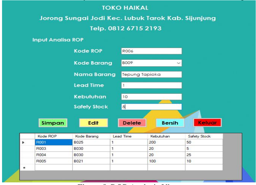
Figure 5. ROP Analysis View

In the ROP analysis view, data incubation includes ROP code, item code, item name, lead time, need, and safety stock. For more details can be seen in Figure 5. below.