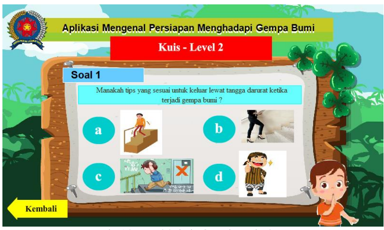
Fig 14. Level 2 Quiz Question Display