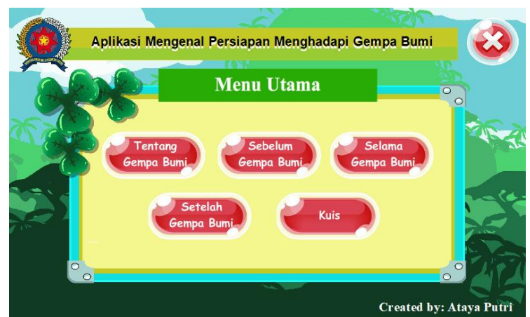
Fig 4. Main Menu Display

The main menu display is a display that contains the main menu, namely, a menu about earthquakes, before, during and after earthquakes and quizzes.