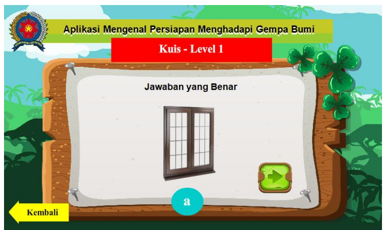
Fig 11. Level 1 Quiz Answer Key Display