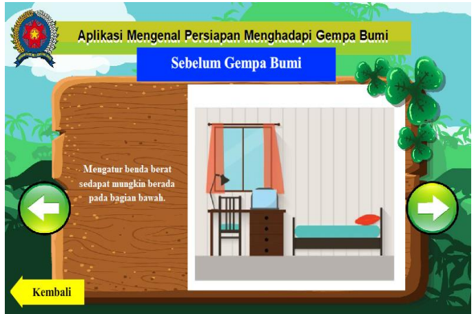
Fig 6. Menu Display Before Earthquake

The menu display before the earthquake serves to go to the menu display before the earthquake.