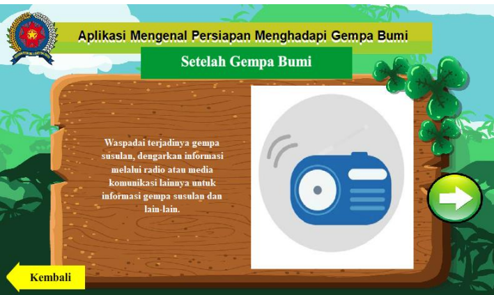
Fig 8. Menu Display After Earthquake

The menu display after the earthquake serves to go to the menu display after the earthquake.