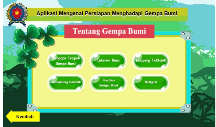
Fig 5. Menu Display About Earthquake

The menu display about earthquakes serves to go to the menu display about earthquakes.