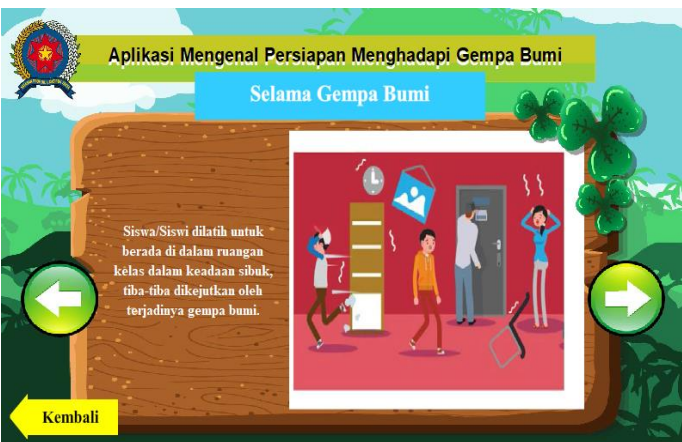
Fig 7. Menu Display During Earthquake

The menu view during an earthquake serves to go to the menu view during an earthquake.