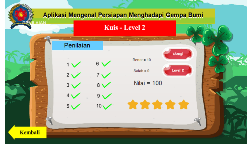
Fig 16. Level 2 Quiz Results Display