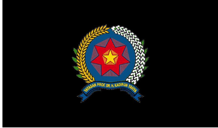
Fig 2. Display Results Loading

The loading display is used as the initial display when the application recognizes preparations for an earthquake. Users have to wait until the loading process is complete to go to the next screen