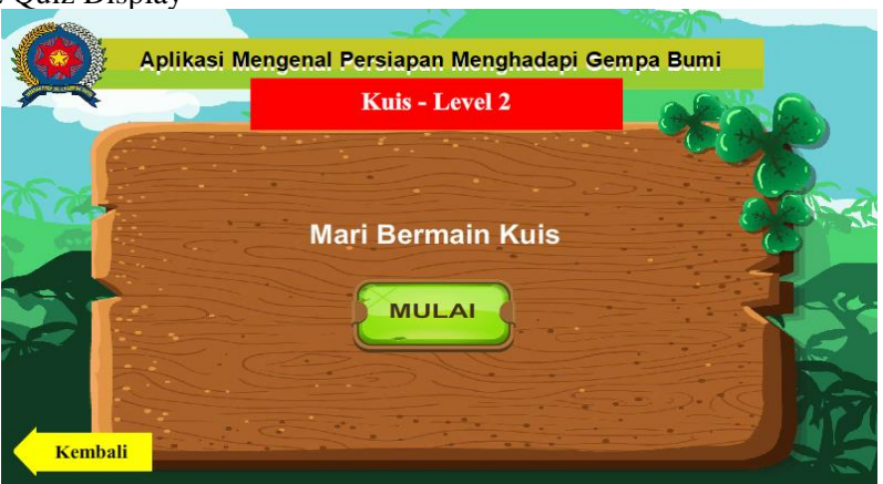
Fig 13. Level 2 Quiz Display