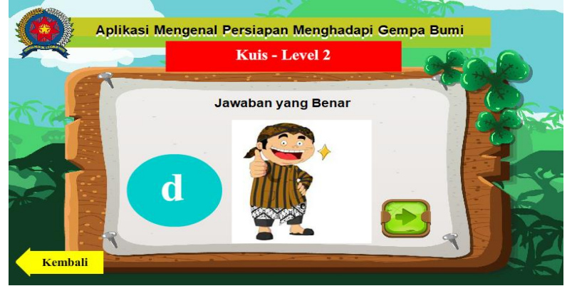
Fig 15. Display Explanation of Level 2 Quiz Answers