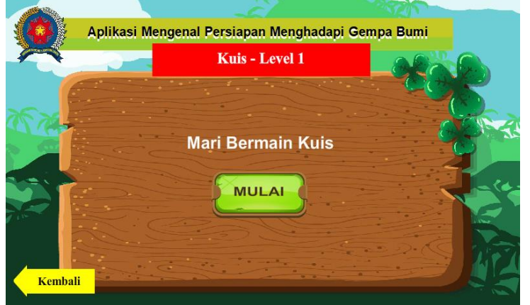
Fig 9. Level 1 Quiz Display

Quiz view serves to go to the quiz menu view. This quiz is divided into two levels, level 1 and 2. This quiz contains 10 questions.