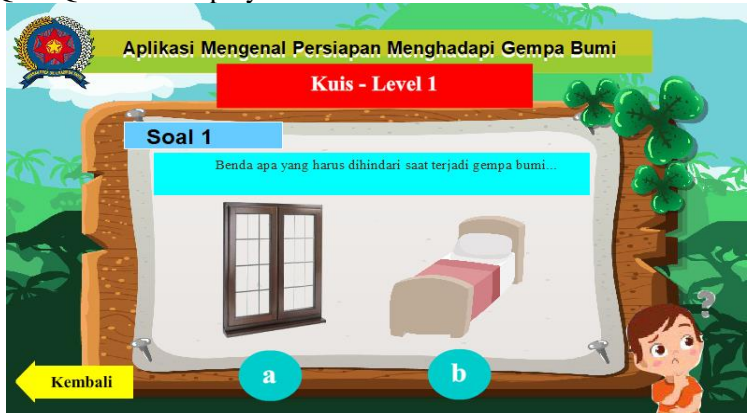
Figure 10. Level 1 Quiz Question Display