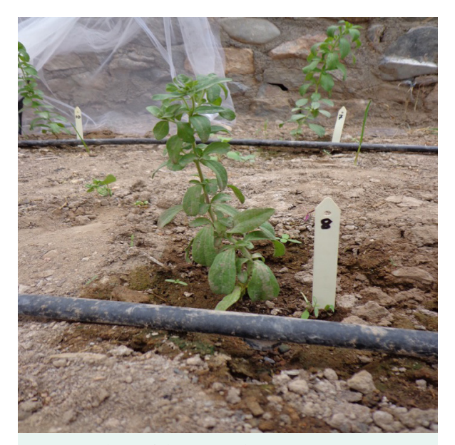
Figure 1. Three of the Stevia plants growing on a terrace at Al-Manakher in JA. The fine mesh net used to protect the plants from insect attack is visible in the background.

of Meteorology and Air Navigation of the Ministry of Transport and Communications to help estimate the three month period when Stevia transplants could be planted in the field in Al-Manakher, JA within its tolerant temperature range (TTR) of 20°C-37°C. The climatological summary of 2011 obtained was from Saiq weather station of the Ministry but was used to estimate Al-Manakher's climate because of its closeness to Saiq. Since the temperature range of an area for a given period of the year approximately repeats itself every year, the projected period selected for 2012 starting from early June to at least end of August was found to favorably fit Stevia 's TTR.