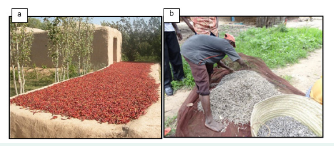
Figure 1. Solar drying by direct sun exposure for (a) Red chili pepper (Walters and Jha, 2016), and (b) Fish (Ochieng et al., 2015).

The efficiency of solar dryers is enhanced by the integration with photovoltaic (PV) systems. The use of PV-integrated solar dryers is very practical if forced convection is to be implemented in the areas where electricity is not available or not affordable (Sahu et al., 2016). In terms of solar drying performance, the greenhouse dryer is considered the best alternative to sun drying. Bala and Janjai (2009) reported that PV-integrated greenhouse solar dryers can reduce the drying time by almost 50%. The shape of the greenhouse is another factor affecting the drying process. It was reported by Charters et al. (2017) that the dome shape (hemispherical) can offer the maximum utilization of solar radiation and the even-span shape is utilized for proper air mixing.