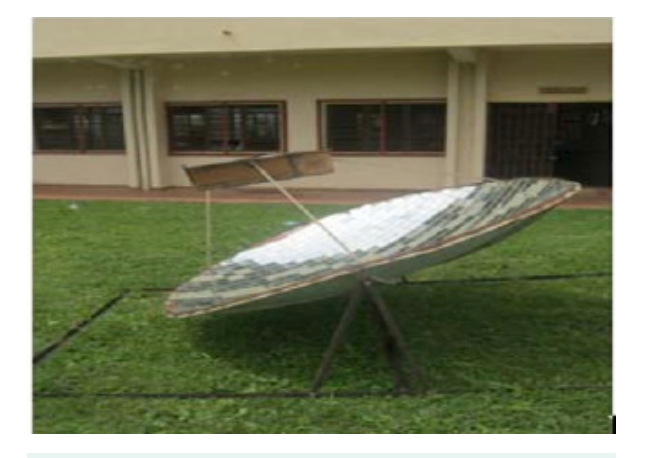
Figure 8. Parabolic-dish solar collector (Solomon et al., 2016).

respectively (Hazarika et al., 2016). In a similar study, Islam et al. (2013) reported that the protein, lipids and ash content for 4 fish types, namely, Amblypharyngodon mola (Mola), Puntius spp. (Punti), Channa punctata (Taki) and Glossogobius giuris (Bele), dried under opensun amounted to 32.02-41.38 g/100 g ( Channa punctatus had the highest value), 3.21-14.03 g/100 g ( Channa punctatus had the lowest value) and 20.14-24.40 g/100 g.