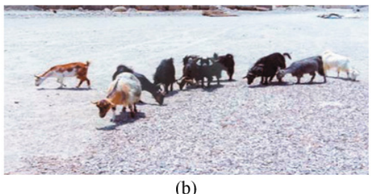
Figure 4. Traditional open-sun drying of sardine, (a) Sardine fish dispersed on a sandy beach and (b) Animals eating from the dried sardine (Al-Jufaili and Al-Jahwari, 2011).

dried fish products. For example, the drying time to reduce the initial moisture content of prawns from 75 to 16.4% in open-sun drying and to 16.5% in a low-cost passive solar dryer was 11 and 8 h, respectively (Sengar et al., 2009). Similarly, Abraha et al. (2017) found that open-sun drying of anchovy took 5 days and inside a solar tent drier, it took only 3 days. Using a natural convective solar drier, it was found that the drier was able to reduce the initial moisture content of bayad fish flakes from 78.67% to a final moisture content of 11.41% (Babiker et al., 2014). Mustapha et al. (2014) studied five different solar driers and found that black stone-inserted glass drier showed the fastest drying rate in comparison to the plastic drier, mosquito net drier, glass drier and aluminum drier for drying African catfish and Nile tilapia. Martunis (2013) reported that the drying rate of fish using a force convection greenhouse was 3.29% per hour in a total drying time of 11 h while the same amount of