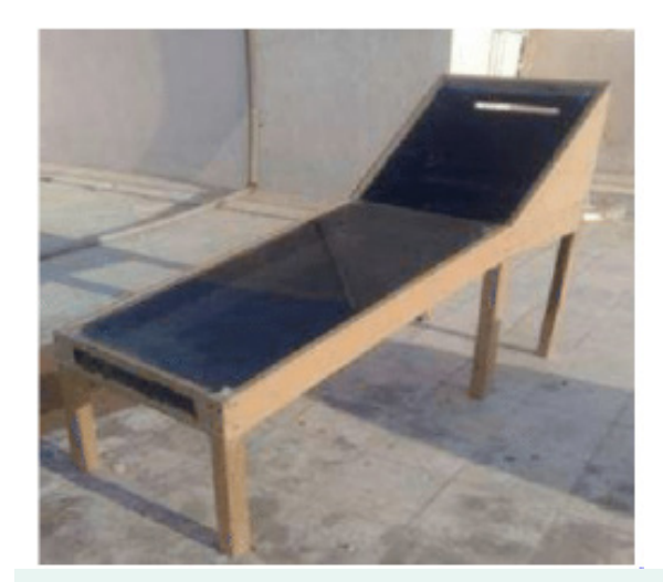
Figure 6. Fish drier diagram (Al Rawahi et al., 2013).

found that the color and texture of salted fish inside a low cost dryer were better as compared with unsalted fish, but the dried fish in open-sun was the least accepted one. In a similar study, the addition of salts in the dried fish affected positively the physical (organoleptic) properties, such as aroma, taste, texture and general acceptability. Solomon et al. (2016) observed good taste and total acceptability of salted fish were superior to those of unsalted fish when both were dried in a solar drier. Therefore, direct and indirect solar drying techniques provide better quality fish than open-sun drying and salted fish gave better physical properties than unsalted fish.