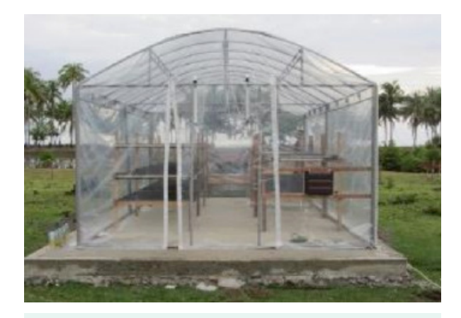
Figure 7. Force convection greenhouse solar dryer (Martunis, 2013).

found that the color and texture of salted fish inside a low cost dryer were better as compared with unsalted fish, but the dried fish in open-sun was the least accepted one. In a similar study, the addition of salts in the dried fish affected positively the physical (organoleptic) properties, such as aroma, taste, texture and general acceptability. Solomon et al. (2016) observed good taste and total acceptability of salted fish were superior to those of unsalted fish when both were dried in a solar drier. Therefore, direct and indirect solar drying techniques provide better quality fish than open-sun drying and salted fish gave better physical properties than unsalted fish.