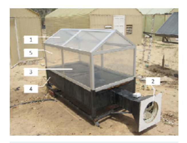
Figure 3. Indirect forced convection solar dryer; 1: Vent , 2: Exhaust fan , 3: Heating chamber, 4: Drying chamber and 5: Glass cover with fibre (Singh et al., 2017).

Solar radiation is an abundant, eco-friendly and inexhaustible source of energy (Ghaly et al., 2010). Hence, it represents the cheapest way to preserve food (Jain and Pathare, 2007). Nevertheless, there are many disadvantage related to open-sun drying method, such as the uncertainties of weather, requirement of large implementation area, time-consuming, poor drying rate, high labour costs, attacking by insects, microorganism and birds, and mixing with dust and foreign materials (Jain and Pathare, 2007; Al Rawahi et al., 2013; Martunis, 2013; Sontakke and Salve, 2015). Mansur et al. (2013) found that, during open-sun drying, some fish samples contained a large amount of debris from the poor quality underlying material and the dried samples have undergone surplus drying or inappropriate drying and handling. However, some of these limitations, e.g. time-consuming, insect attacks and dust contamination, can be