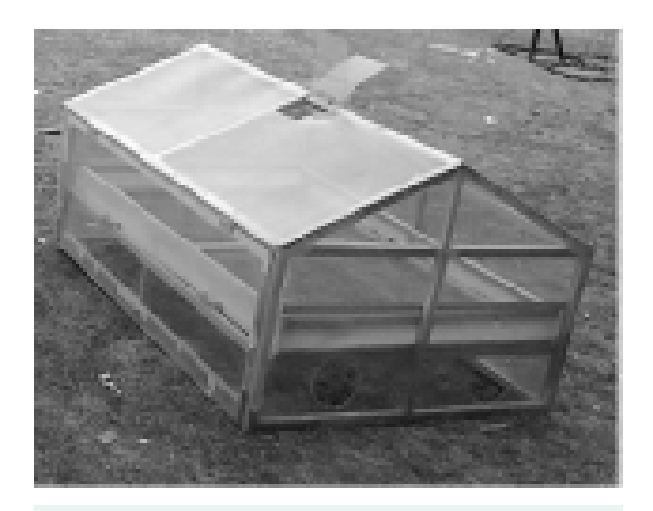
Figure 2. Direct solar dryer (Singh et al., 2017).